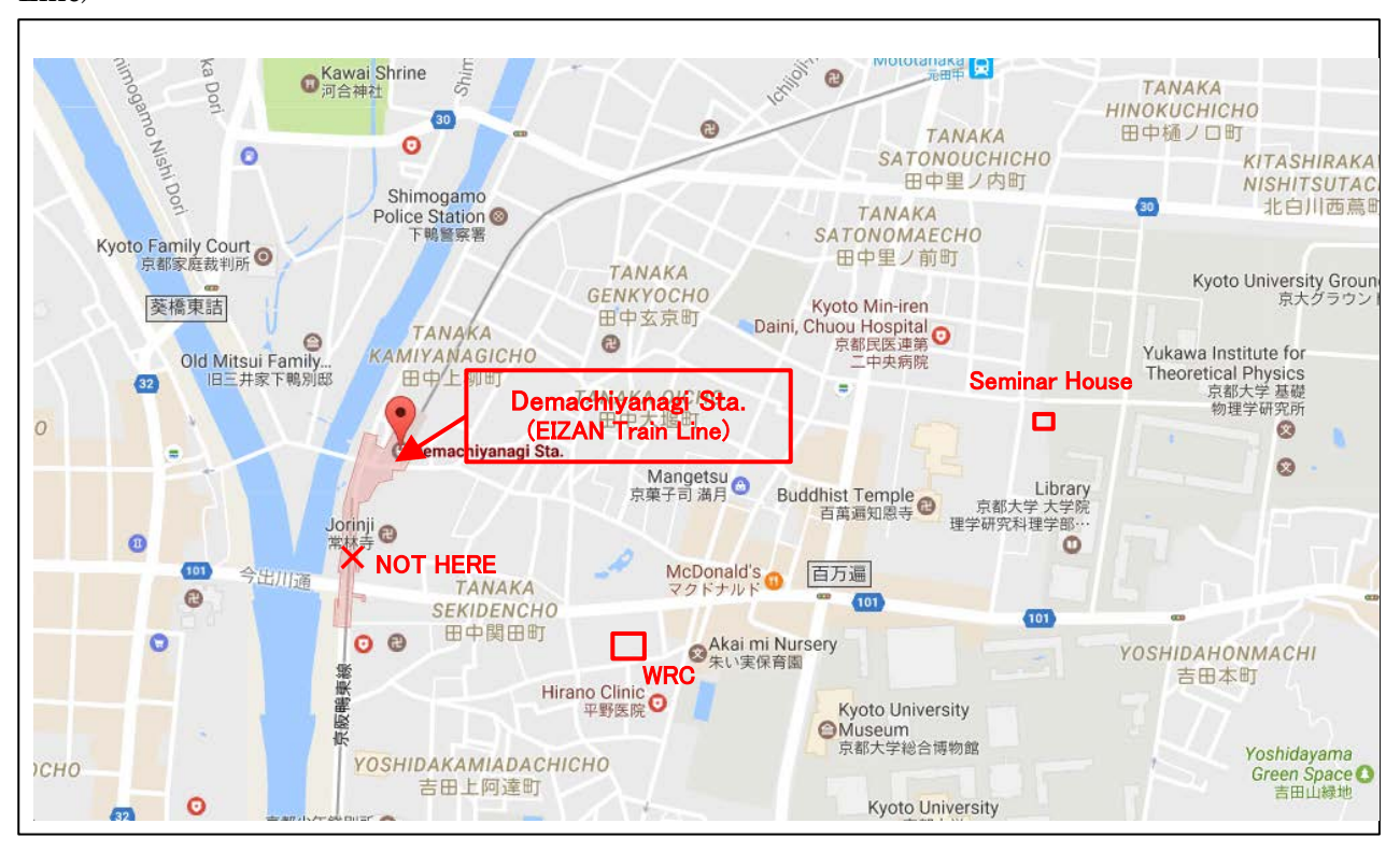
(MAP 1 – Meeting Location : In front of the ENTRANCE of Demachiyanagi station (EIZAN Train Line)