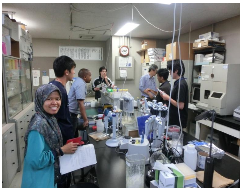
Photo 2: Group photo for the insect metagenome course participants.

I was very impressed with the Japanese life style. It is good and adorable. One thing which was very impressing is how the instructors interact with their students during training.