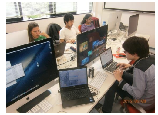
Analysis for sequence data

From 2th to 9<sup>th</sup> in June, I attended genome science training. I was a member of whole genome group and analyzed whole genome of Yakushima macaque. In this course, sequencing data was obtained in last year by next generation sequencer (Illumina Miseq). These data was assembled through de novo program and mapped by referencing to whole genome of rhesus macaque, one of the closest related species. By these treats we got information about whole genome of Yakushima macaques. In our team, each of us analyzed what each member feels interested in by respectively. And I investigated about major histocompatibility complex (MHC). MHC is a genome region relating with immune system of all vertebrates. And it is said that MHC is very polymorphic because these polymorphism enables MHC molecular to combine various antigens, which has been adaptive. So I investigated differences of diversity between in MHC and in whole genome. I compared MHC with whole genome about heterozygosity, which is an index of genetic diversity, and non-synonymous mutation at heterozygous sites. As a result, these were significantly higher in MHC than in whole genome. This result may suggest that as often be said, traits of heterozygous genotype in MHC might have been selected. Though it was the small part that I could analyze of whole genome, I want to analyze more and particularly want to estimate past population size of Yakushima macaques based on whole genome sequence data.