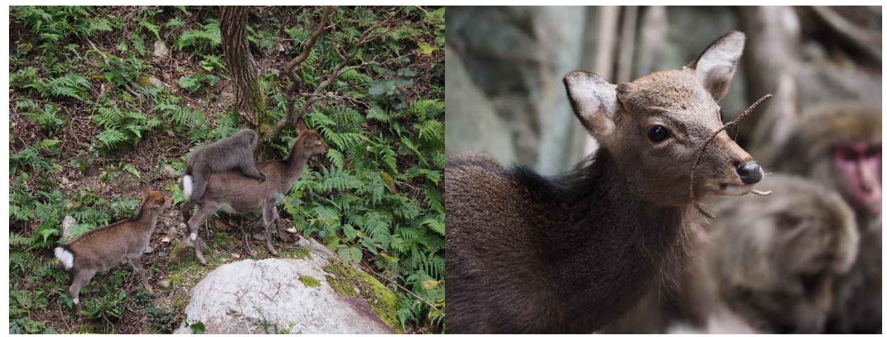
A monkey riding deer