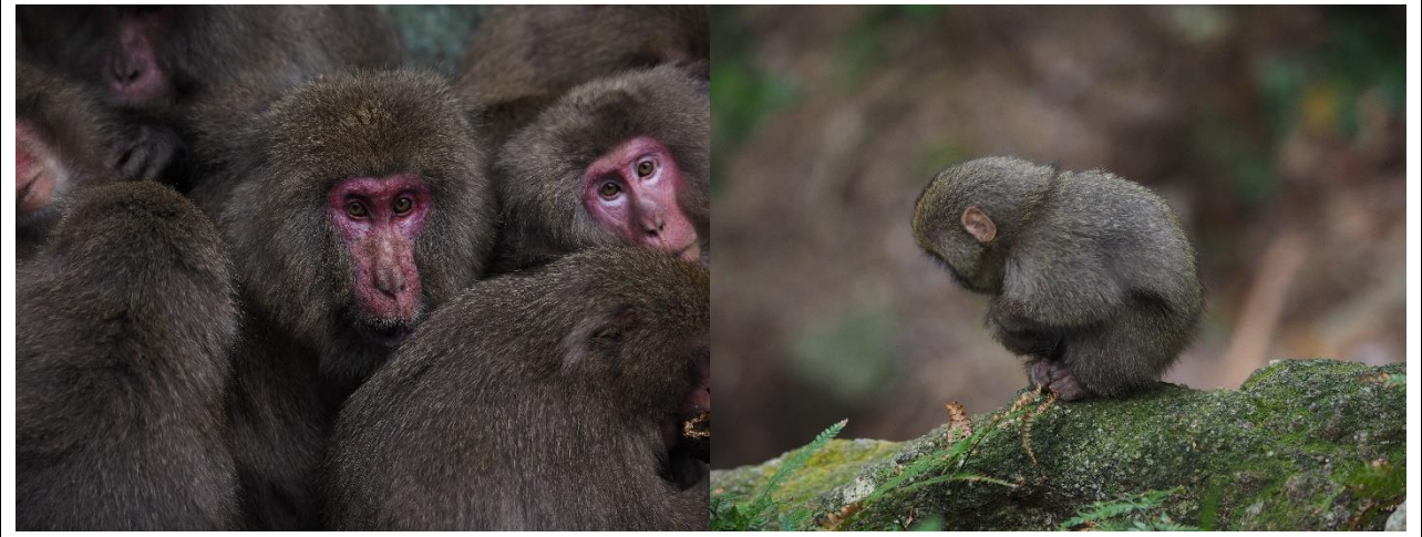
Sitting huddled together, which is called "saru-dango"