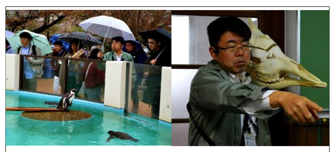
Fig. 3. Kyoto City Zoo (left) and specimen collection (right).

(Please be sure to submit this report after the trip that supported by PWS.)