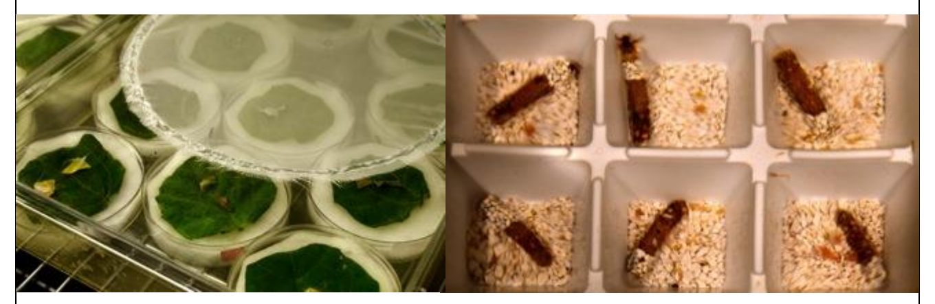
Fig. 4. Center for Ecological Research.