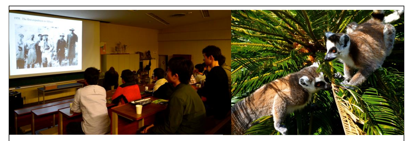
Fig. 6. Japan Monkey Centre (JMC). Lecture on the history of JMC (left) and ring-tailed lemurs in Wao Land (right).

(Please be sure to submit this report after the trip that supported by PWS.)