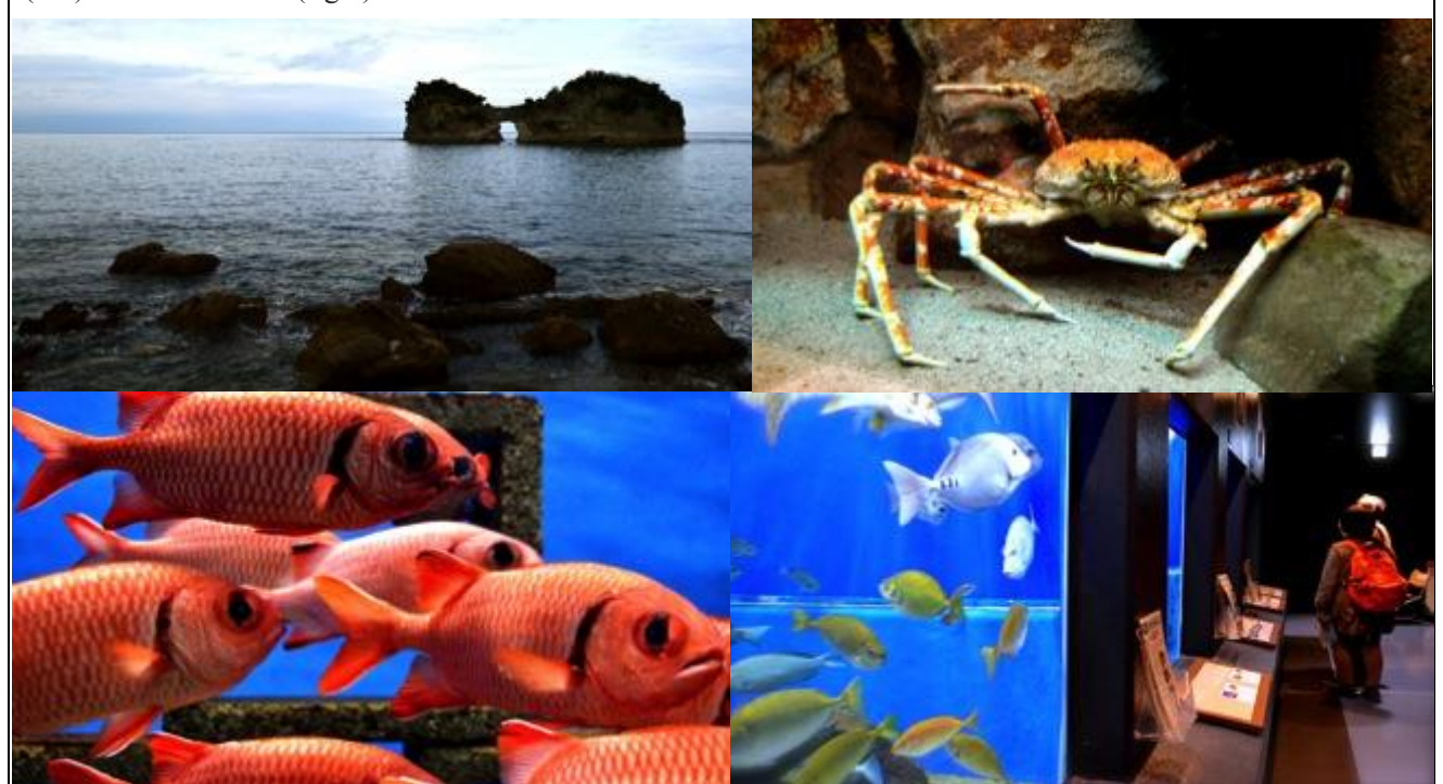
Fig. 2. Seto Marine Biological Laboratory. Engetsu Island (upper left corner) and Shirahama Aquarium.