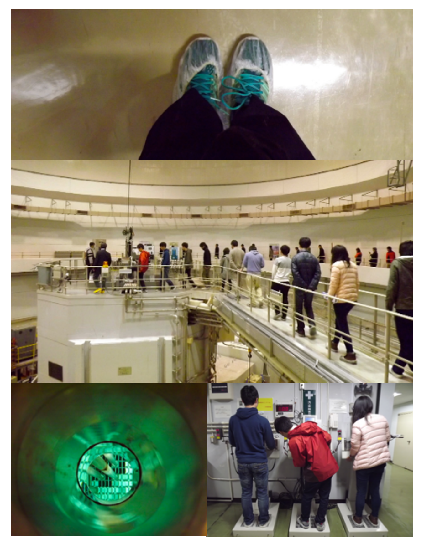
Top: safety measures; middle: students approaching the nuclear reactor; bottom left: inside the reactor; bottom right: students checking their radioactivity after visiting one of the reactor. Research Reactor Institute, Kyoto University.