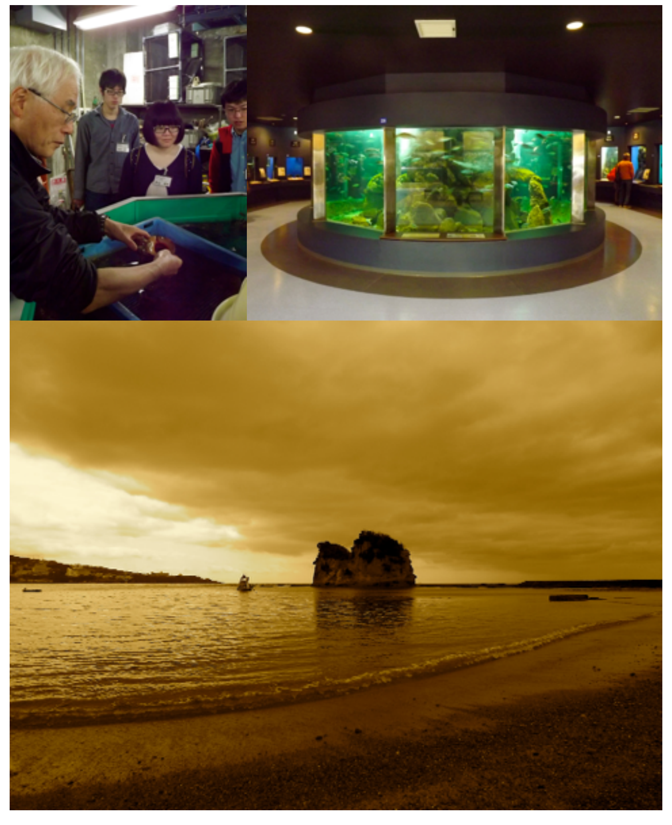
Top left: researcher showing a Tutufa bubo to the students; top right: Shirahama Aquarium; bottom: scenery in front of Seto Marine Biological Laboratory, Wakayama prefecture.