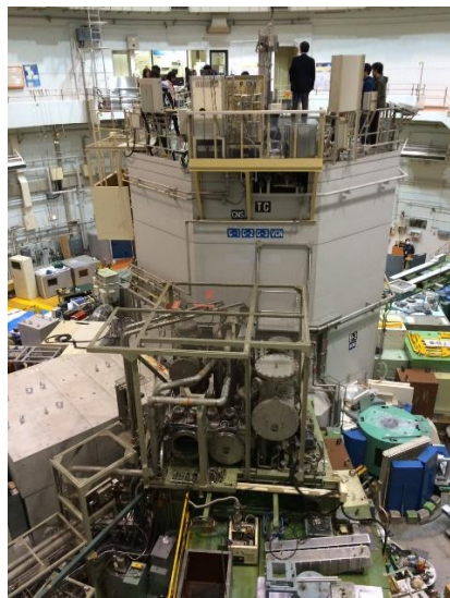
Photo A. Kyoto University Research Reactor.

Research Reactor Institute: The trip to the institute was brief, but well organised and on time. Although the lecture before visiting the reactor was in Japanese, I thought some of the research presented was interesting and important – particularly Boron Neutron Capture Therapy (BNCT) for treating cancer. The visit to the nuclear reactor itself was a rare opportunity to see inside the reactor and learn first-hand how it is operated.