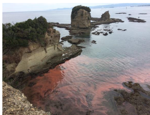
Photo D. Coastline around Seto Laboratory.