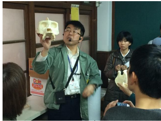
Photo F. Explanation of primate bone structure.

Center for ecological research: We listened to several lectures from researchers and toured some of the facilities to see research with caddisflies. Although the visit was brief, I was impressed with the effort which the staff made to give their lectures in English. In fact, for the benefit of the foreign participants some researchers gave their presentations only in English, which was very thoughtful and a great help.