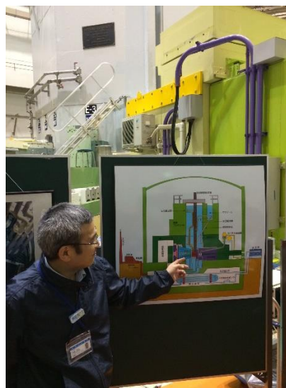
Photo B. Explanation of how a nuclear reactor works.

Seto Marine Biological Laboratory: The trip to the laboratory took approximately four hours from Kyoto, but the bus was very comfortable and we arrived on time. On the second day we listened to several lectures from researchers talking about their chosen species in Japanese, e.g. water spider and jelly fish. Then we were taken on a tour of the field site to see the aquarium, different vegetation and insect species, and features of the coastline. Although the tour was very visual and entertaining, it would have been nice for our guides to use a bit more English in their explanations.