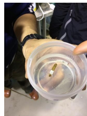
Photo H. Caddisfly larvae.