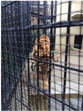
Photo E. A tiger pacing stereotypically at Kyoto City Zoo.