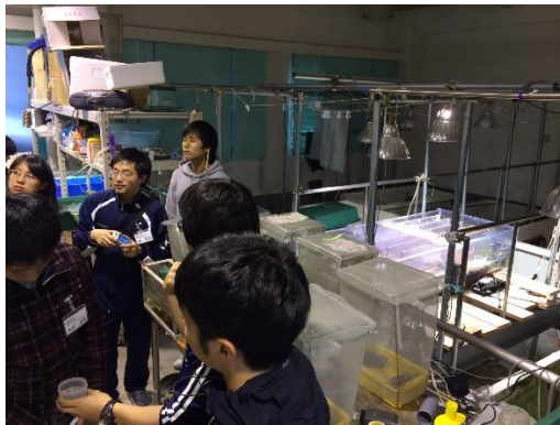
Photo G. Facilities for breeding and raising caddisflies.

Center for ecological research: We listened to several lectures from researchers and toured some of the facilities to see research with caddisflies. Although the visit was brief, I was impressed with the effort which the staff made to give their lectures in English. In fact, for the benefit of the foreign participants some researchers gave their presentations only in English, which was very thoughtful and a great help.