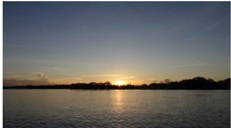
Beautiful sunset in Amazon