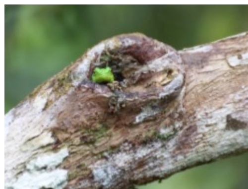
Black water river was reflecting the blue sky and green forest / A small lizard.