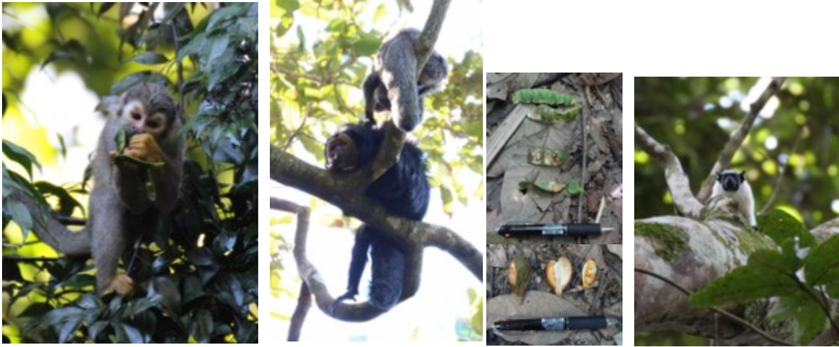
A common squirrel monkey / White-faced saki (male and female) /Fruits after saki ate / A pied tamarin