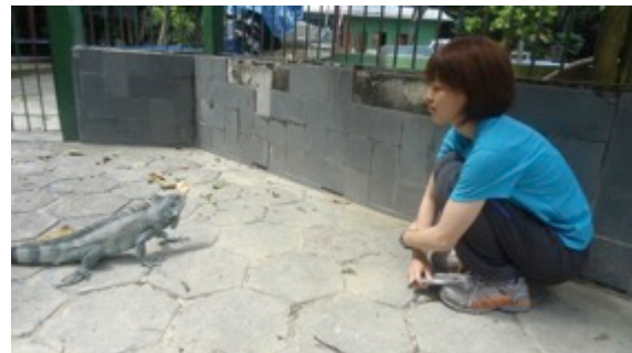
A meeting about “Field Museum Project” at INPA / Green iguana and me