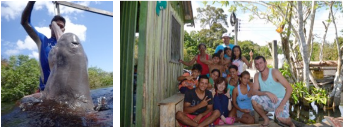
Ecotourism activity with amazon river dolphins / Group photo with my host family in Mamiraua reserve