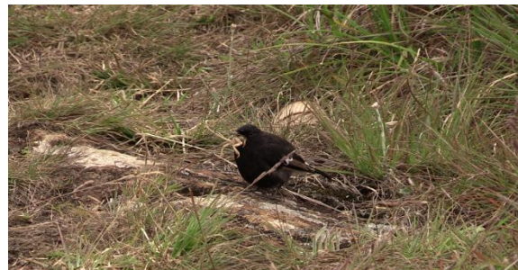
Bird eating a dry frog in Horton Plains National Park