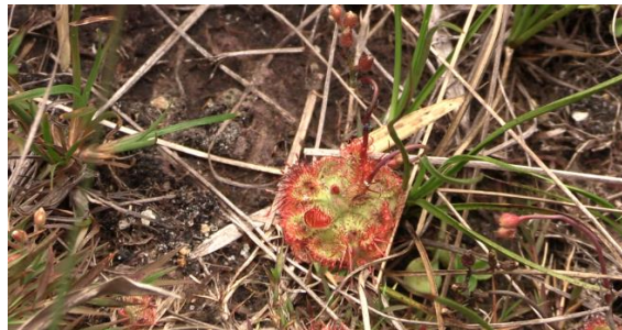
Carnivorous plant in Horton Plains National Park