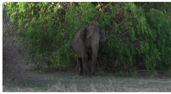
Asian elephant in Bundala National Park