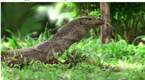
Monitor lizard in Madu Ganga