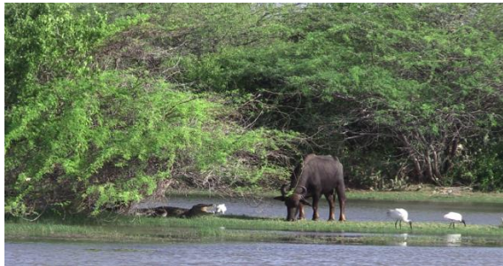
Crocodile, birds, and water buffalo in Bundala