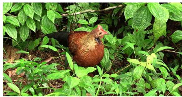
National bird, the junglefowl, in Sinharaja rainforest