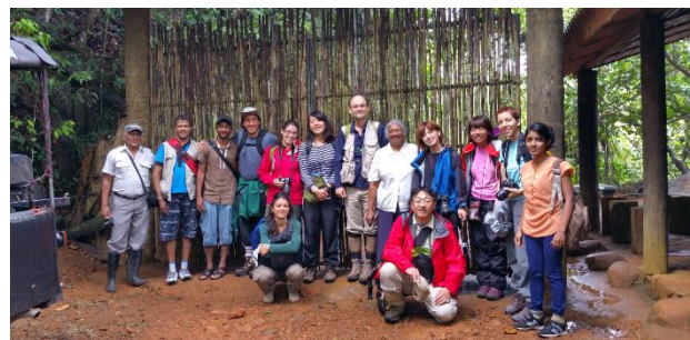
Group photo in Sinharaja rainforest