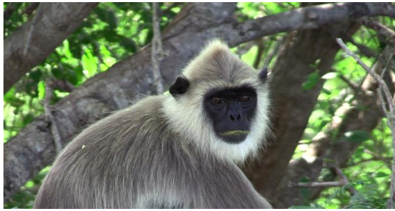
Grey langur in Bundala National Park