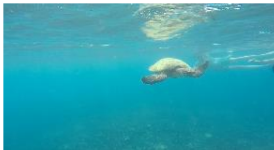
Me swimming with a turtle in Pigeon Island