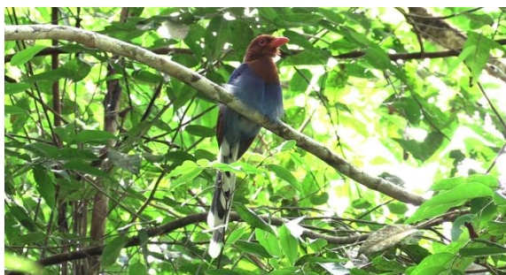
Blue magpie in Sinharaja rainforest

In general, this program, in addition to be very well organized, was a wonderful experience, we got to see many different places with many different species. We had the chance to have the best resource researchers of the country to explain us about the different places or topics integrating the program. We visited many national parks, many temples, we also went to Sinharaja and Sigiriya which are two World Heritage Sites. Sri Lankan people are very warm welcoming, very kind and smiling. I have learned a lot about the country in terms of fauna, flora, and habitats that we can observe here and I enjoyed being integrated to a new culture and got to experience it.