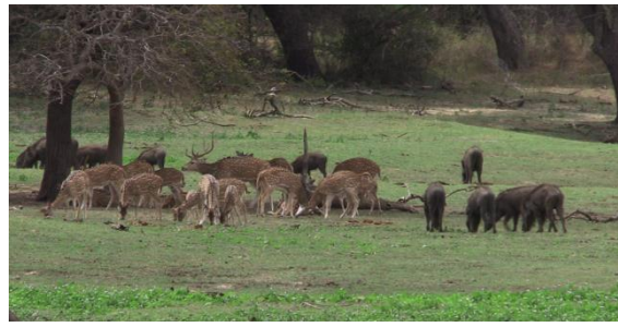
Spotted deers and wild boars in Yala National Park