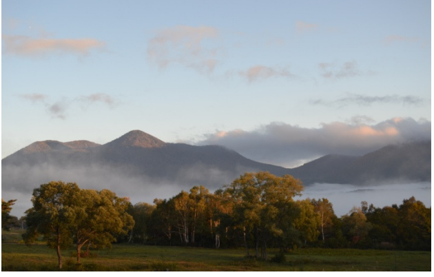
Fig. 14. Mountain view from the Sasagamine Hütte.