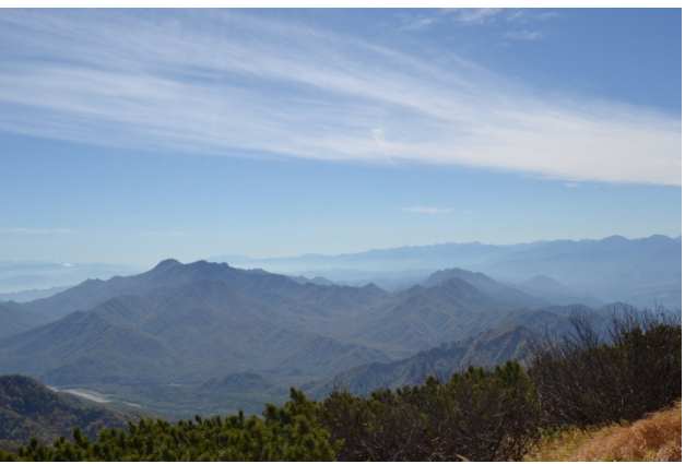
Fig. 17. Mountain view from of the Mount Hiuchi's summit.