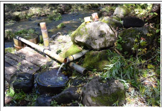
Fig. 6. Water drinking fountain in a small stream in Sasagamine.

(Please be sure to submit this report after the trip that supported by PWS.)