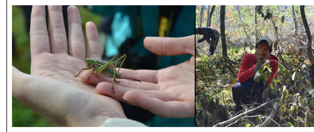
Fig. 4. A grasshopper found near Sasagamine Hütte.