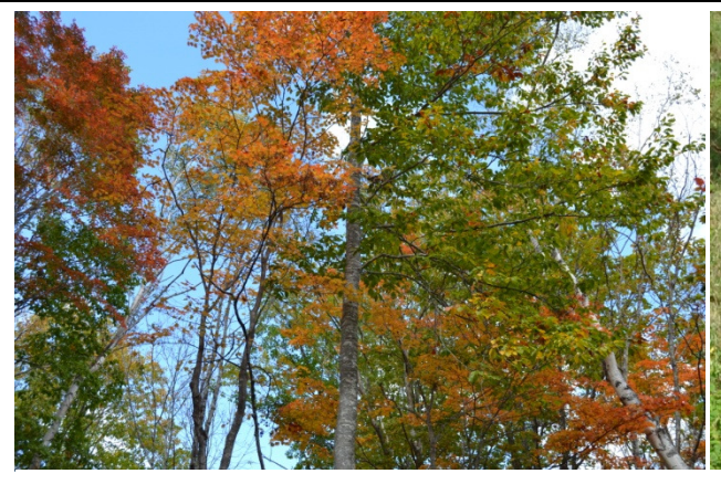
Fig. 12. Changing of the season in Sasagamine.

(Please be sure to submit this report after the trip that supported by PWS.)