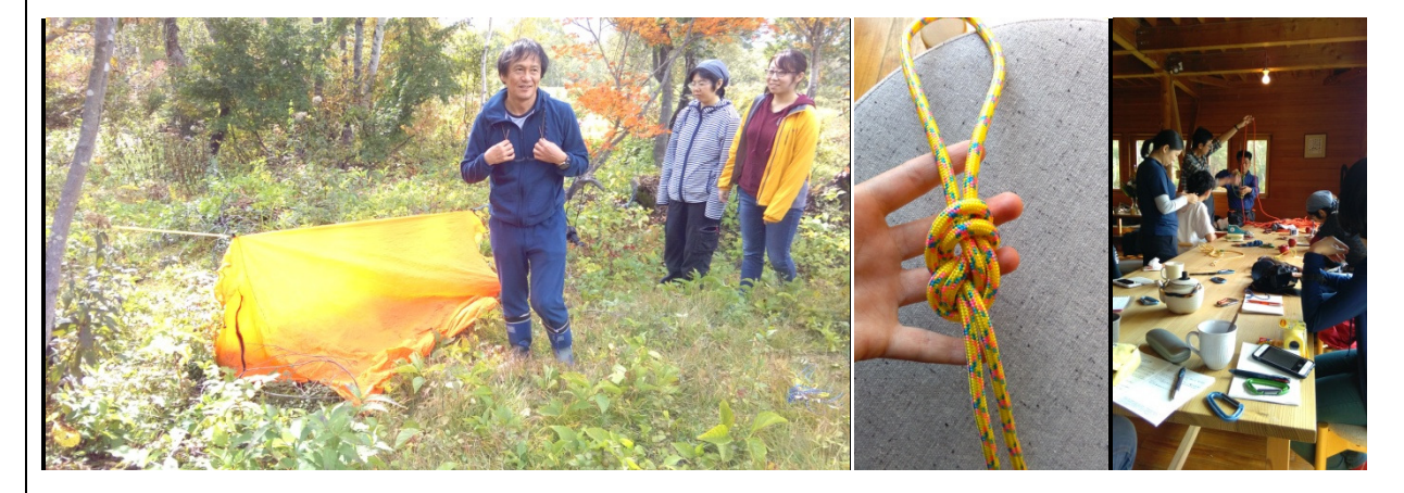
Fig. 20. Lecture on bivouac uses and functioning.