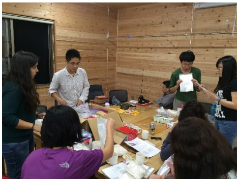
Deer team getting ready!