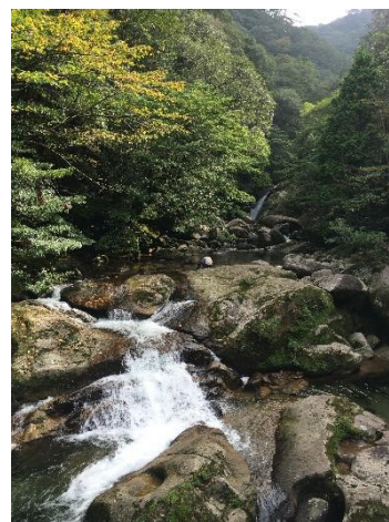
Mountains in Yakushima.