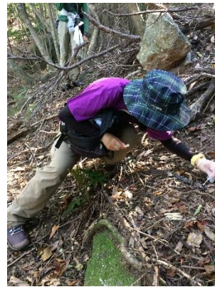
Future scientists and new friends!