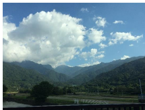
Great mountain view from our site.