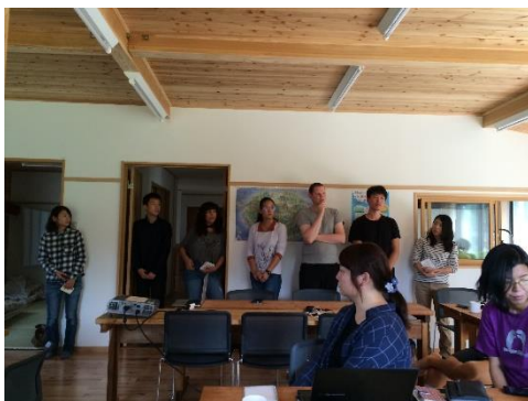
Presenting our findings in Yakushima!