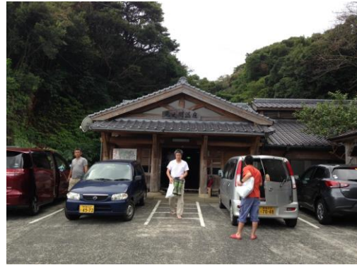
Relaxing at the onsen after collecting samples.