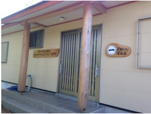
The new PWS field station in Yakushima.