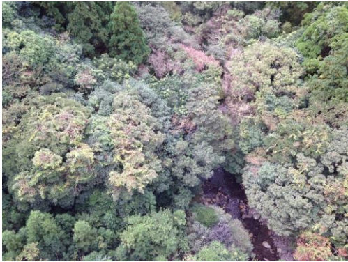
View from above the second site, Miyannoura.