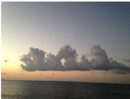
Beautiful sunset by the beach in front of the station.