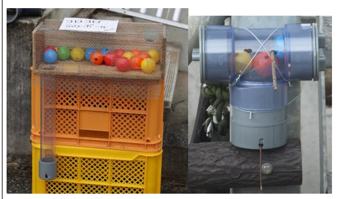
Fig. 1, 2. Corocoro soy ball (Left: Big one, Right: Small one)

It was very good experience to design and make enrichment materials. I think to imagine how animals play the material and what kind of materials is suitable for animals. It was very good opportunity to think about enrichments.