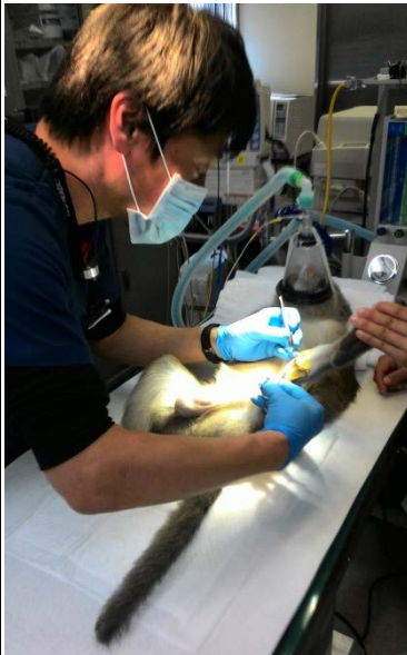
Figure 1. Veterinary course

We did specimen course. I learned museum needs to store all specimens which were used as samples in paper. I assume JMC faces a problem of place for storing such materials because many studies were conducted in JMC and JMC does dissection for 50~80 individuals per year. I have never studies about bones in detail but I found each work relates to specimen is interesting. I could understand that the body of human being and monkey is almost similar. And even small piece of bone, like the one from squired monkey, each bone has its own feature and can identify in which part this bone belongs. It might be good to conduct this lecture to primary school students because they can compare the movement of living individual which JMC keeps with the structure of bones of that species.