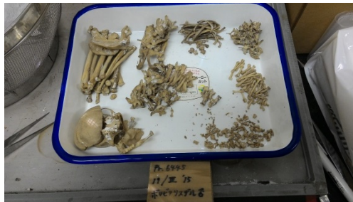
Figure 2. Specimen lecture