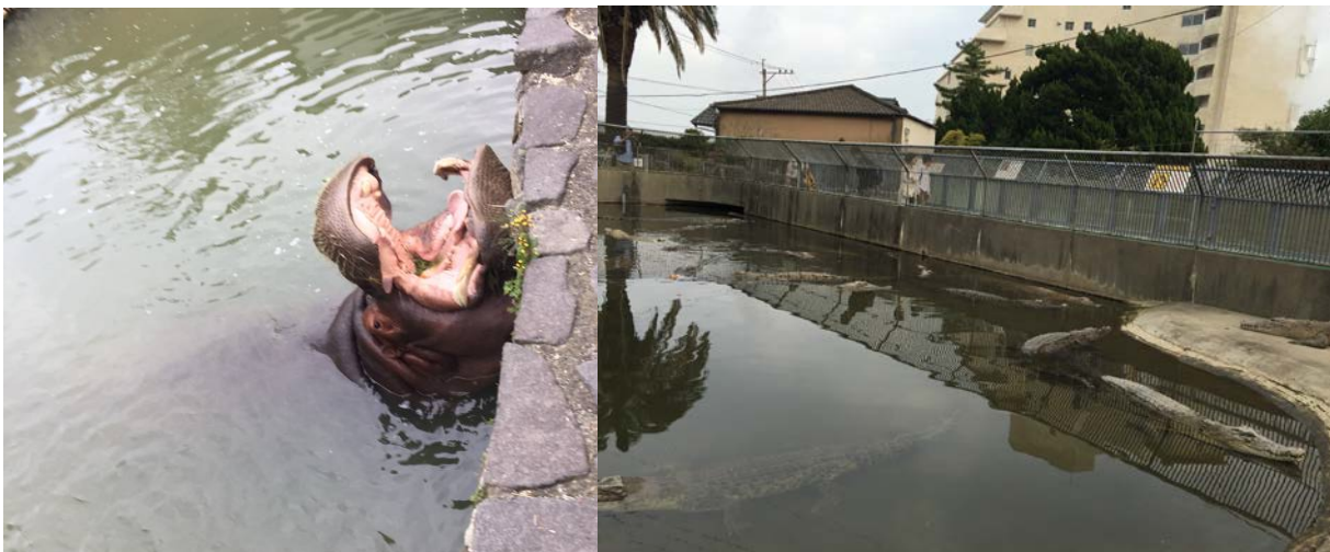
Figure 3. Hippo at Yama hell (left) and one enclosure of crocodiles at Oniyama hell (right).

In the next day, we visited Takasakyama Monkey Park. Mount Takasaki is 628m high, along the coast between Beppu and Oita City. The mountain is home to 1522 free-ranging Japanese macaques. They are divided into two separate troops (B and C) 732 and 790 individuals respectively, making them some of the world's largest monkey troops. The troops take turns coming down to the monkey park, one in the morning and one in the afternoon. The monkeys seem to have a good coat quality in comparison to Shodoshima monkeys, and the fur looks darker than Jigokudani monkeys. The staff of the park feed the monkeys on wheat a few times per day and sweet potatoes once in the morning. The feeding time was a good time to notice how large the group is, because there were so many monkeys running gathering and competing for food (Figure 4). I was surprised to see the method they use to throw potatoes: running along the park with a cart that contains a hole on the back, so the potatoes are dispersed during the run. I observed peculiar