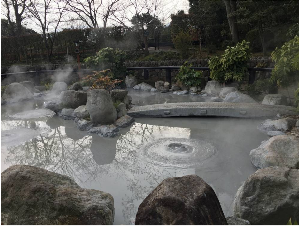
Figure 2. Oniishi Shaven Head Hell gets its name from the gray mud bubbles it spouts that are said to resemble a monk's shaven head.