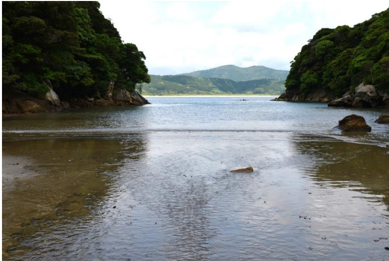
The beach in Koshima

In this course, I learned about the method of behavior observation and data analysis. These are important in my future study. I thought I could get a great opportunity. There are many methods of observation and data analysis. I used a part of them in this course. I need to learn other methods for my study.