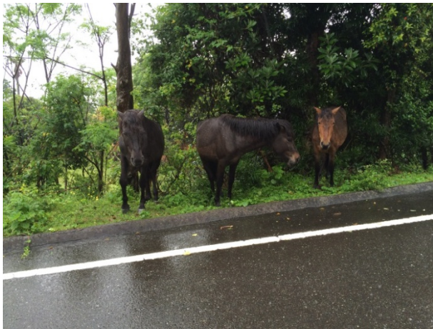
Horses in cape Toi