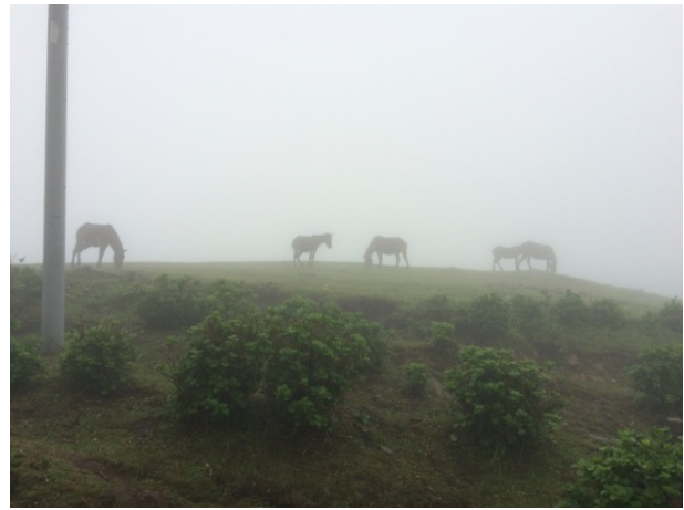
Horses in cape Toi