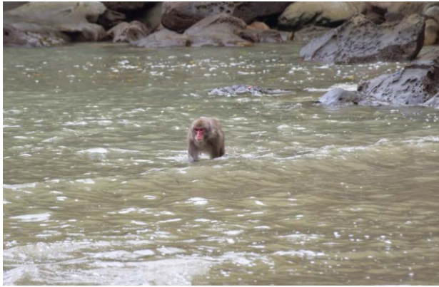
In the sea