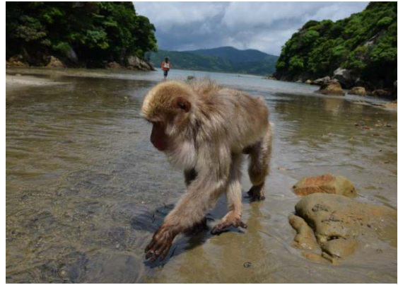
In the river