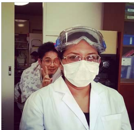
Figure 4. Funny moment in lab

The proximity with colleagues that work with different areas of Biology was good because we shared our knowledge and all learned from the experience of others.