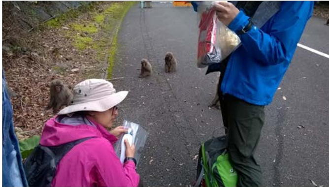
Figure 2. Sample collection