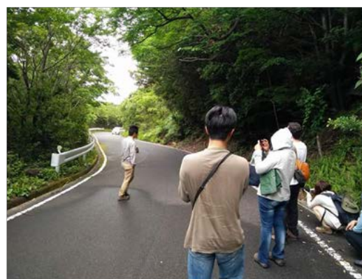
Figure 1. Observing Japanese macaques in lowland

Lab protocols were conducted to prepare samples for digestibility analyses. Three parameters were used in digestibility analyses; pH, gas production and change in substrate volumes. Samples were mixed, weighed, carbon-dioxide added, incubated, centrifuged, filtered, dried and finally we had a final weight.