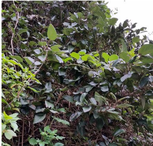
Fig 2 Ficus pumila