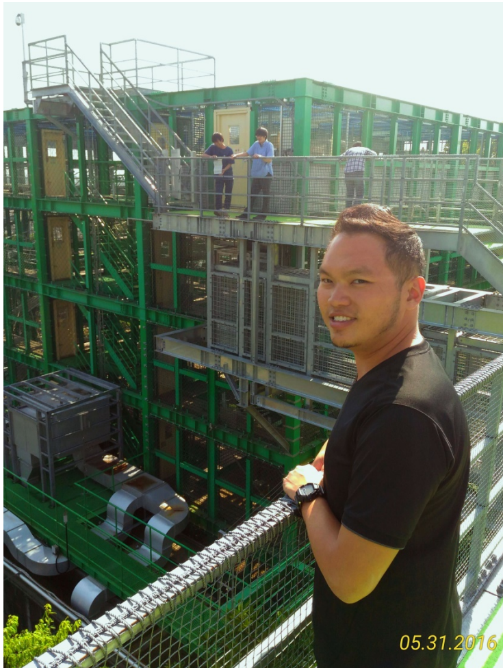
Visiting the Chimpanzee research facilities at the Primate Research Institute.

from deceased animals that accurately reflect what it would be doing in nature such as the poses it might adopt in natural settings. Thus taxidermy can give these creatures a second lease of life when they are properly immortalized for display.