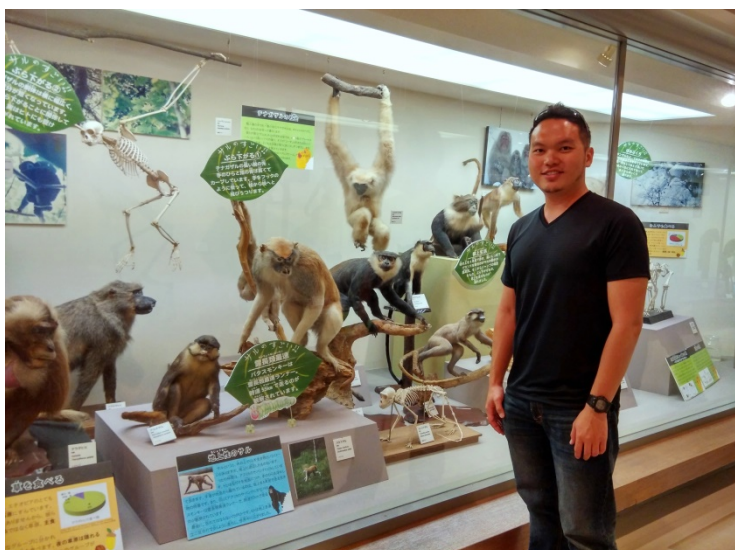
Visiting the collection at the visitor’s center of the Japan Monkey Centre.