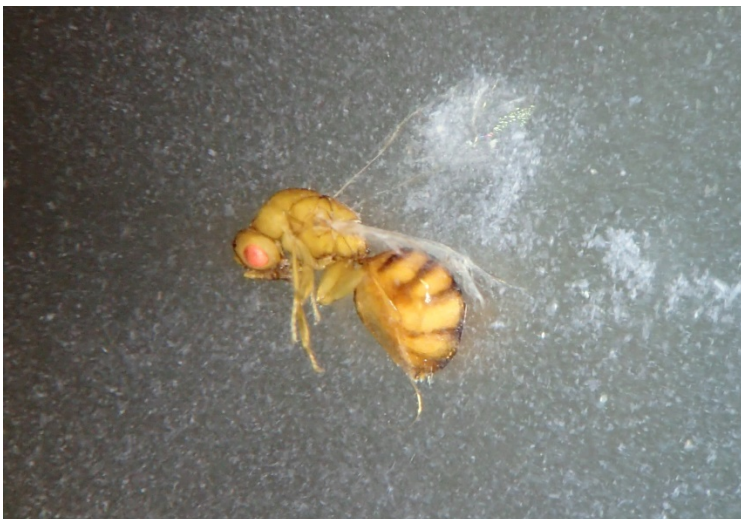
Fig wasp ( Wiebesia sp.) collected from the syconia of Ficus microcarpa photographed prior to DNA extraction.

Once again I am very grateful for the guidance of the lecturers involved in the course and the efforts of all my team mates who worked hard to make the project a success. Many of the participants did not have any previous experience with molecular analyses but together we overcame the many challenges we faced. Our findings and results are currently being refined to be presented as a poster for the 5 th International Seminar on Biodiversity and Evolution: New Methodology for Wildlife Science in Kyoto on the 7 th of June 2016.