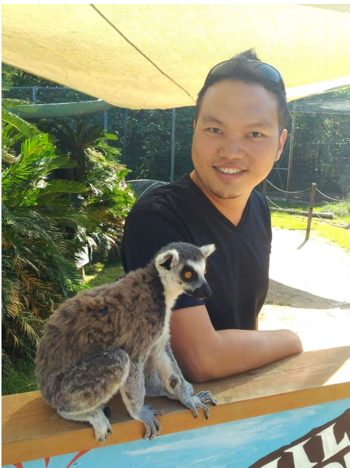
Meeting a Ring-tailed Lemur at the Japan Monkey Centre.