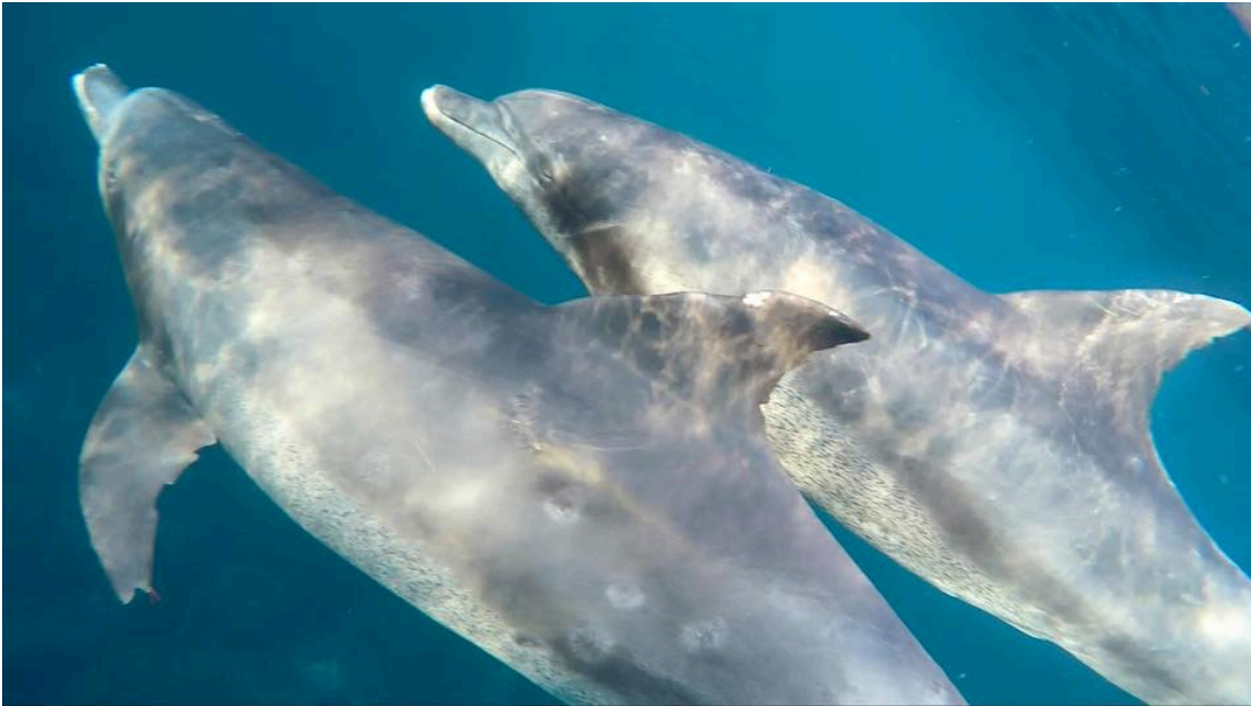
Fig.2 pair swimming pairs