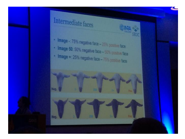
Lucille Bellegarde: Face-based perception of emotions in dairy goats using 2-D images