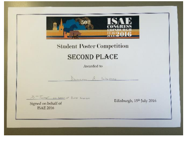
Poster Award certificate Second Place (out of 80 poster entries)

My poster: 'Eye preferences in response to emotional stimuli in captive capuchin monkeys'