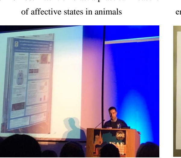
Closing ceremony Announcement of my poster award