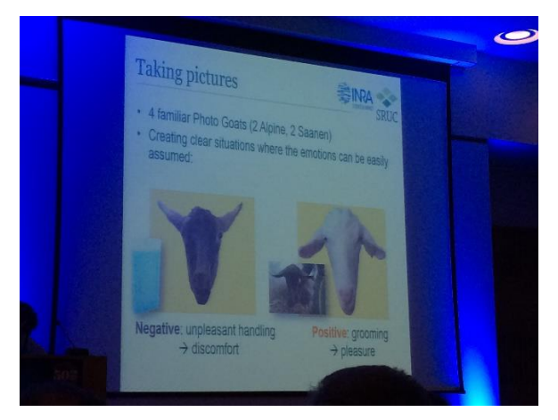
Lucille Bellegarde: Face-based perception of emotions in dairy goats using 2-D images

(Animal cognitive bias and emotion researchers)