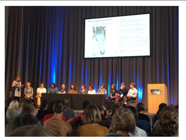
Measuring Animal Emotion Workshop Panel Discussion