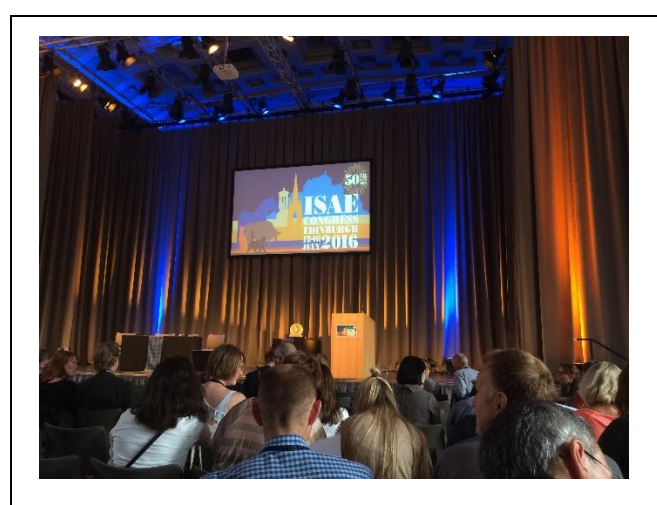
Opening ceremony The largest ISAE Congress ever