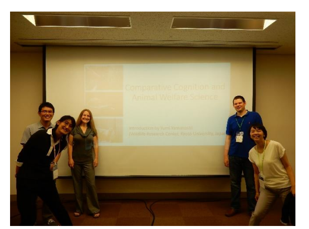
Symposium contributers Comparative Cognition and Animal Welfare Science

'Eye preferences in response to emotional stimuli in captive capuchin monkeys (Sapajus apella)'