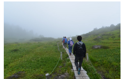
Photo6. Walk in a mist