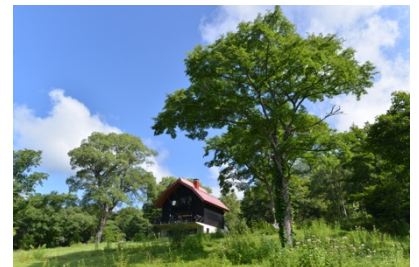
Photo9. Sasagamine Hut