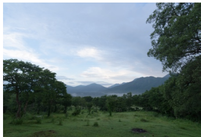
Photo4. View from Hut