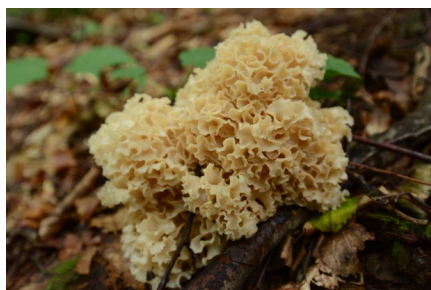
Photo10 Sparassis crispa