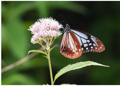
Photo1. Paranitica sita