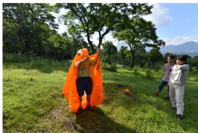
Photo8. Lecture on zert