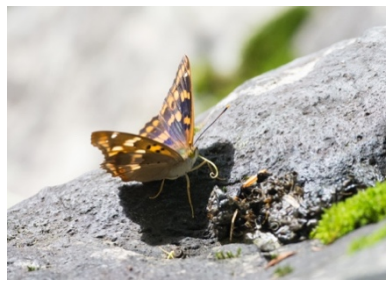
Photo2. Gallicarpa japonica