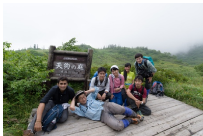
Photo7. Group photo