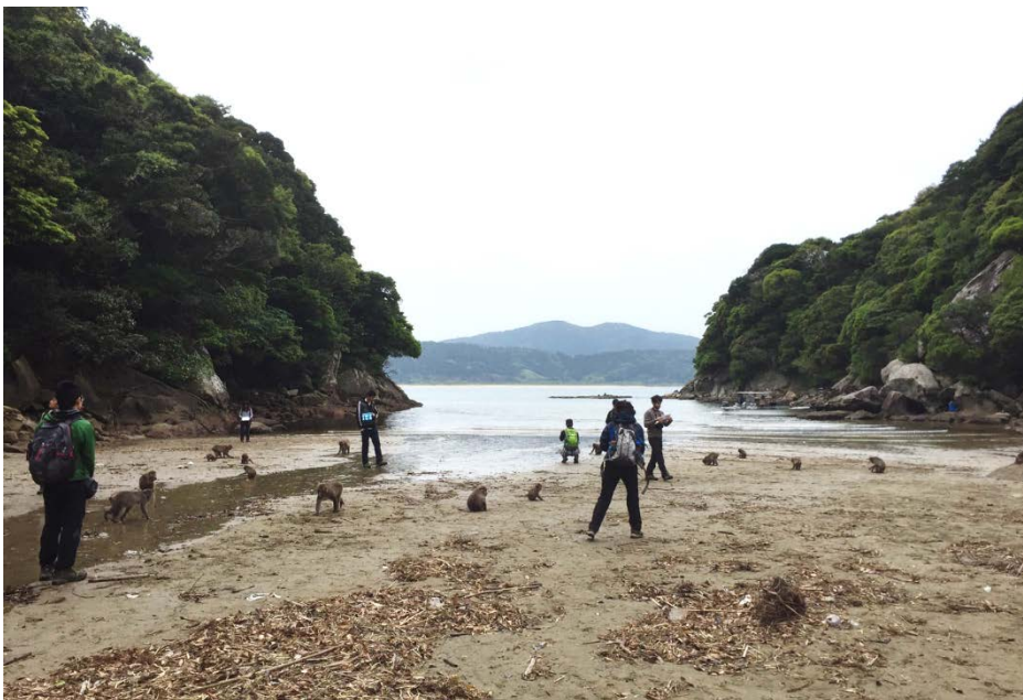
Fig.4 Survey at Odomari beach