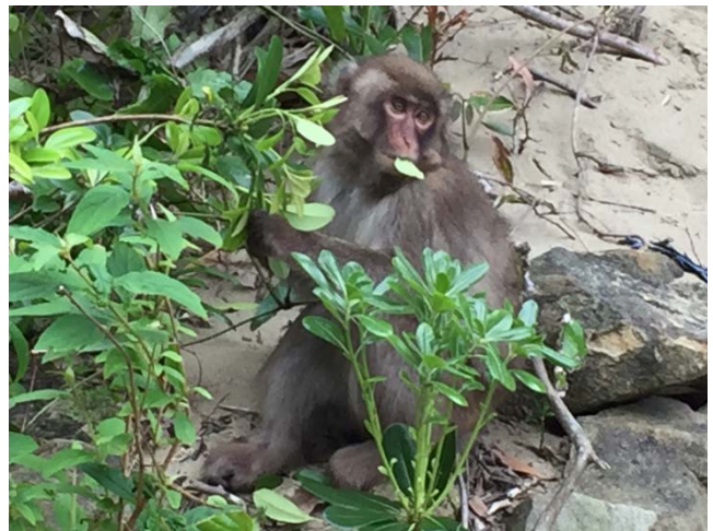
Fig.3 Adult monkey in Odomari beach, Koshima