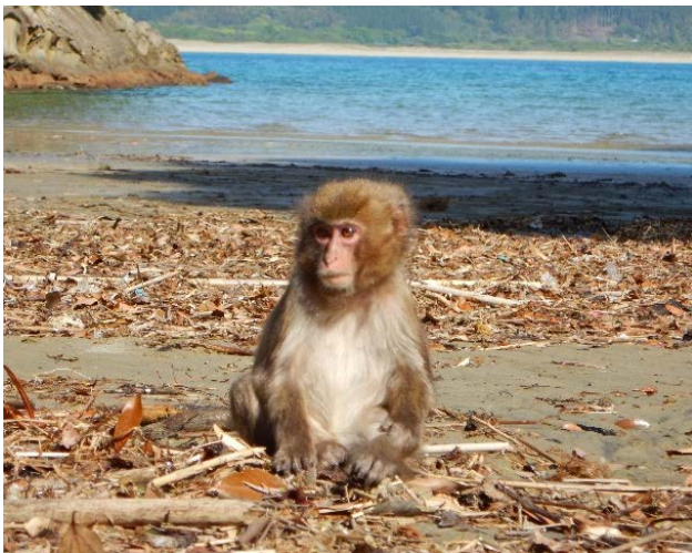
Fig.2 Child monkey in Odomari beach, Koshima