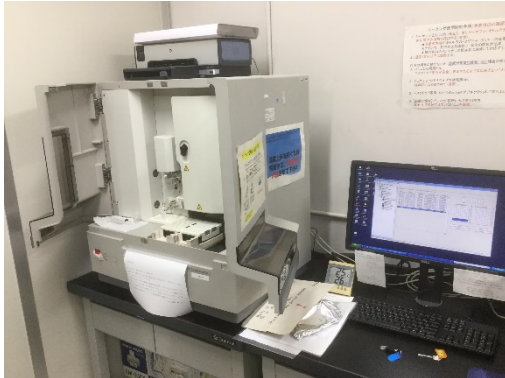
The DNA sequencer we used

We are currently working on a scientific report based on the results of the Yakushima field cause and Genome science course.