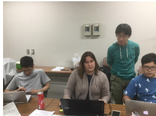
Designing our poster