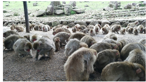
Figure 3. The scene of feeding time. Many monkeys gathered close and ate crops or vegetables.

PWS programs have provided me with good opportunities to observe some Japanese macaque troops such as Koshima Island, Yakushima Island and Shodoshima Island. These groups have its own characteristics in terms of physical or social properties. Japanese macaque is one of the most popular wild animals in Japan and at the same time, an important animal based on which Japanese primatology has been developing. I hope to see other troops like Simokita Peninsula or Kinkazan Island. Moreover, I suppose learning about relationships between monkeys and modern human societies in Japan will help us to understand the Japanese macaques more comprehensively.