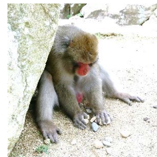
Figure 4. An adult male handling stones.