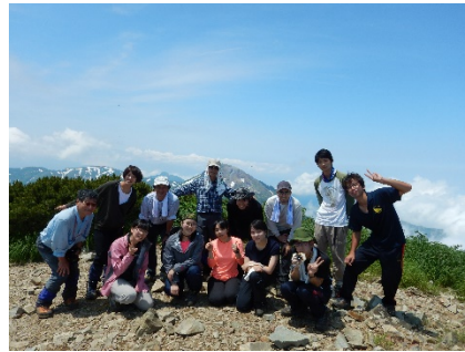
We climbed Mt. Hiuchi