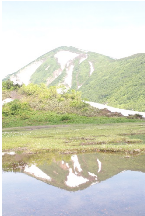
Mt. Hiuchi reflected in the Tengu-no-Niwa

We had better weather than last time and I was able to enjoy the beautiful views. Although I was not able to see any Japanese macaques or raccoons on this trip, I was able to enjoy other aspects of Sasagamine that were new to me. On this course, I was able to not only learn invaluable survival skills but also the importance of facing new challenges without being biased by prior assumptions.