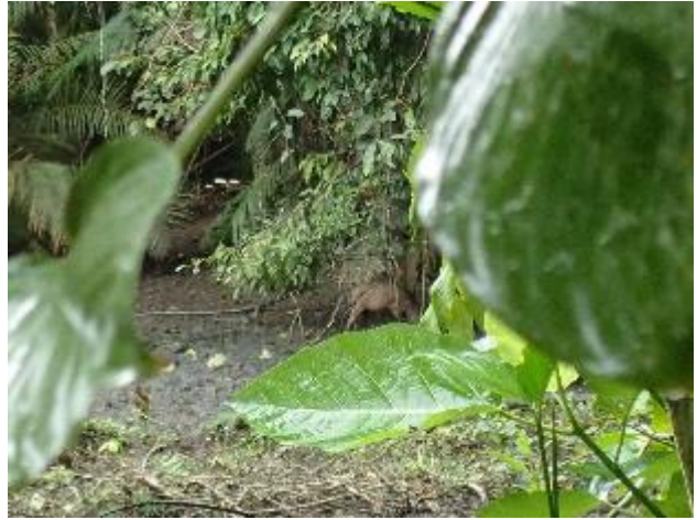
saltlick and babirusa