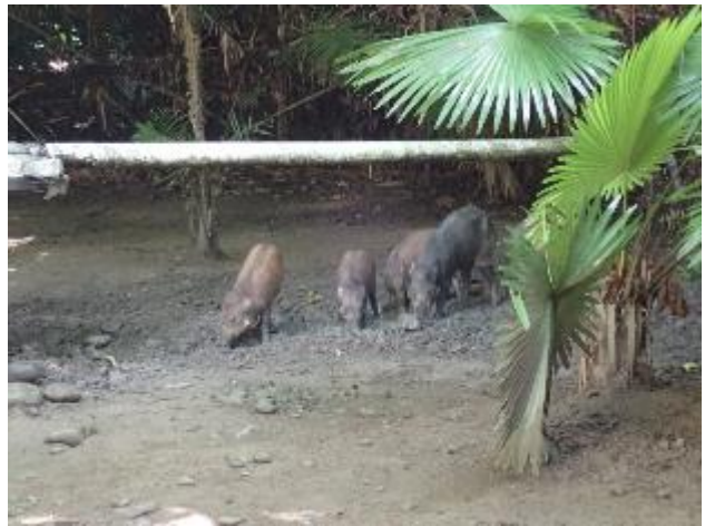
black macaque and wild boars