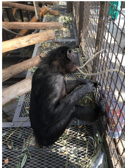
Fig.5 Bonobo using Endless Honey Trap