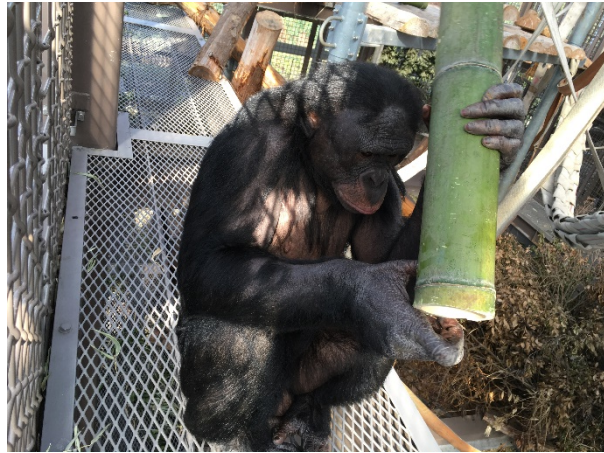
Fig.4 Bonobo using KAGUYA②