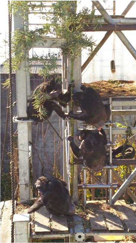
Fig.3 Chimpanzees using KAGUYA①