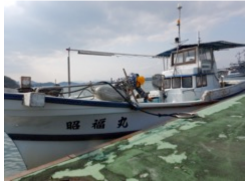
↑ Ship going to the raft and the owner of the ship