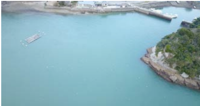
↑ Sunameri around the raft set the hydrophones