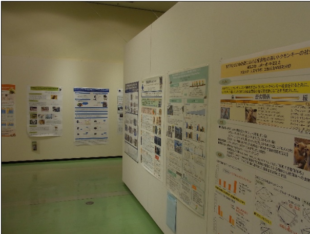
Figure 2. Poster place