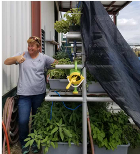
They are doing “olfactory enrichment” with some herbs

Miami zoo was good from the aspect of its size of each exhibition. I already visited some good zoos in U.S and Europe so there are not so many new things actually. However, I was impressed by that not only young children but also older children and adults were there. In most of the zoos which I visited before in U.S. and Europe looked as if they targeted only toddlers. Because those zoos were very nice, I wondered why they targeted only young children. Therefore I thought it’s very good points.