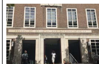
Congo Research Network ↓