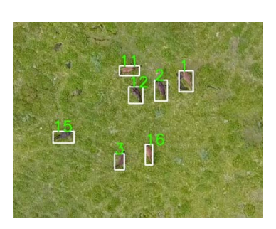
Automatic tracking of individuals

3. After visiting Lincoln park zoo, we moved to University of Wisconsin-Milwaukee in Milwaukee to join the conference, Animal Behavior Society 2018. I gave a poster presentation regarding my horse study. In the session of poster presentation, it was much casual stile than those in Japan. That's why I was able to discuss with fun. International conferences like this motivates me to study more hardly. I am looking forward to join next behavior conference in Chicago 2019.