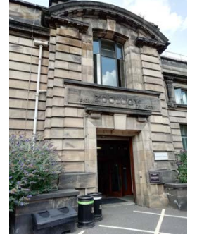
University of Glasgow