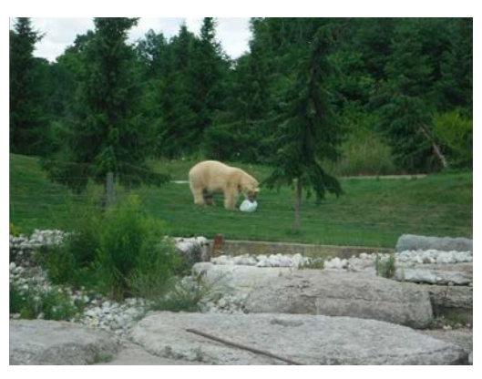
Pic.2 Play with enrichment item

In the aquarium and the museum, I felt not only to exhibit but also to emphasize the experience space such as the place that children can actually learn by touching and moving, and the corner by curators.