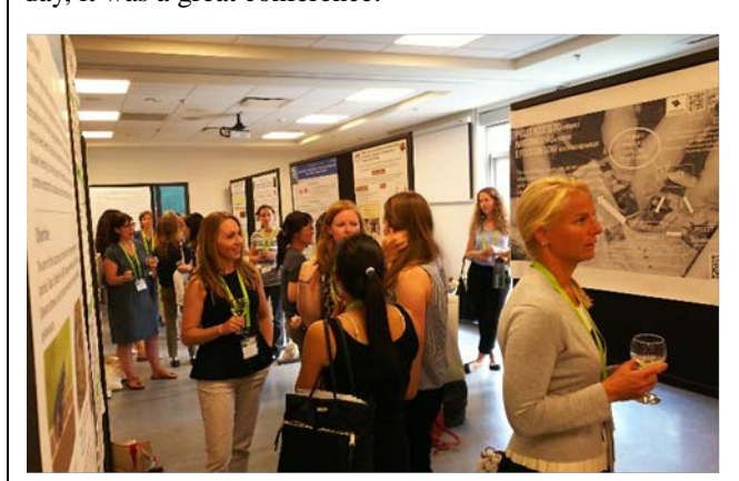
Pic.5 Poster session

Participation in ISAE 2018 from 30th to 3rd August was very meaningful. Since I was a single participant, many people had actively spoken to me, and it became a study of communication in English, not to mention research. At the poster presentation, I also held discussions with numerous researchers including those studying stereotypic behaviors as well as those studying the visitor effect. Many people were interested in the difference of environment in the zoos in Japan and overseas, and I was able to convey the unique idea of the zoo in Japan. Supported by a lot of people until the final day, it was a great conference.