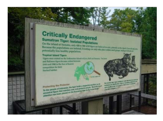
Pic.1 Sign on the extinction of Sumatran tiger

During my stay in Toronto from 26 to 28, I visited the Toronto Zoo, the Ripley Aquarium and the Royal Ontario Museum. The Toronto Zoo has a very large site area, but also actively engaged in environmental enrichment and conservation education.