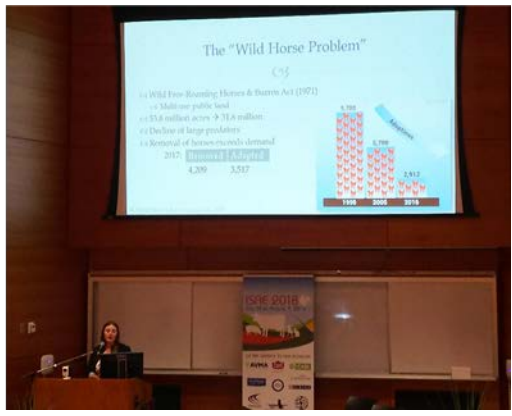
Pic.6 Oral Presentation