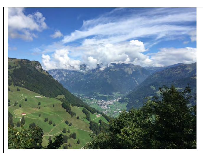
View of the Swiss Alps, near Braunwald, Switzerland