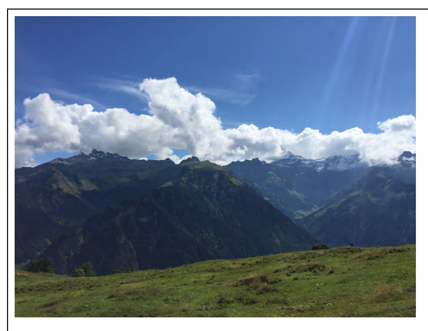
View of the Swiss Alps, near Braunwald, Switzerland