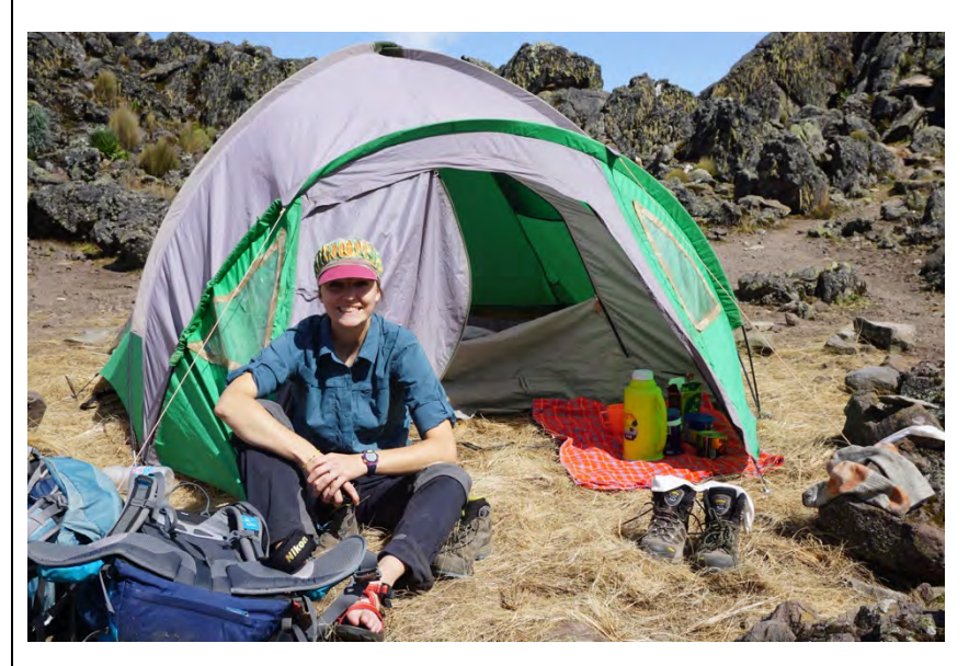
Our campsite after the second day of hiking and before our sunrise summit of Mt. Kenya the next morning.

Submit to: report@wildlife-science.org 2014.05.27