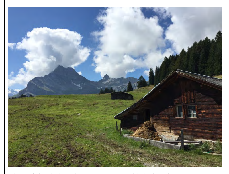
View of the Swiss Alps, near Braunwald, Switzerland