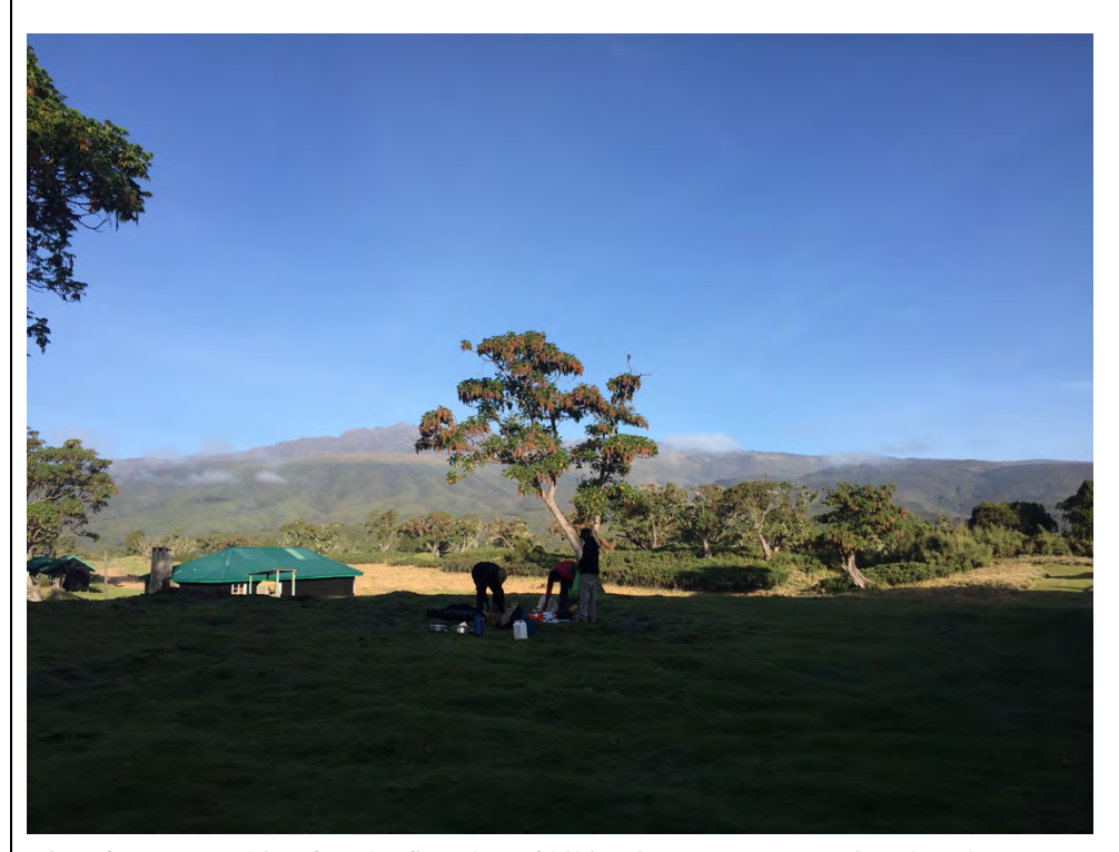
View from our cabin after the first day of hiking in Mt. Kenya National Park.

(Please be sure to submit this report after the trip that supported by PWS.)