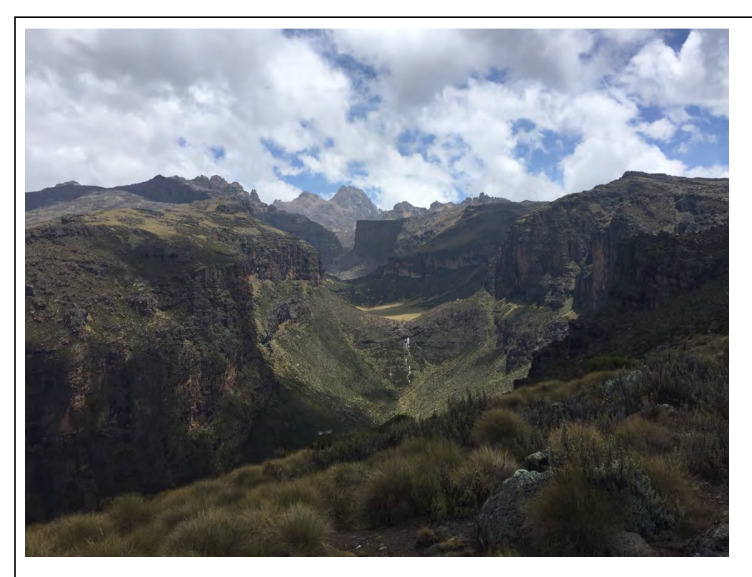
View into the gorge along the hike to the summit of Mt Kenya (seen in the far distance).

(Please be sure to submit this report after the trip that supported by PWS.)