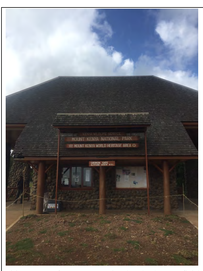
Sirimon Gate of Mt. Kenya National Park where we finished our 4 day trip.

(Please be sure to submit this report after the trip that supported by PWS.)