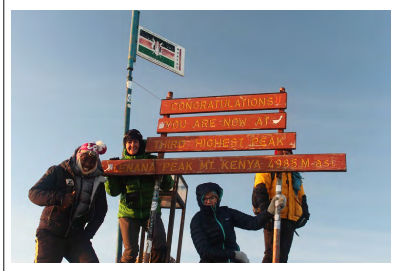
Point Lenana, one of the three summits of Mt. Kenya at 4,985m.

We woke up and hiked in the dark to reach the summit at sunrise.