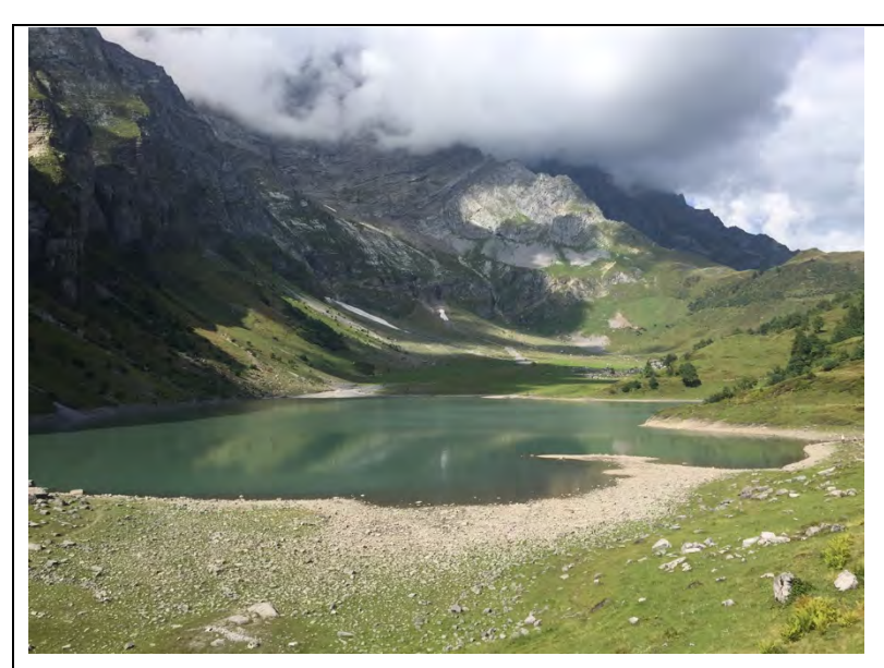
Lake Oberblegisee in the Swiss Alps, near Braunwald, Switzerland

Submit to: report@wildlife-science.org 2014.05.27