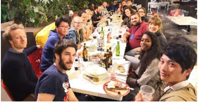
At our dinner of mainly graduate students from over 5 primate centers all over the world at Village Market in Kenya.