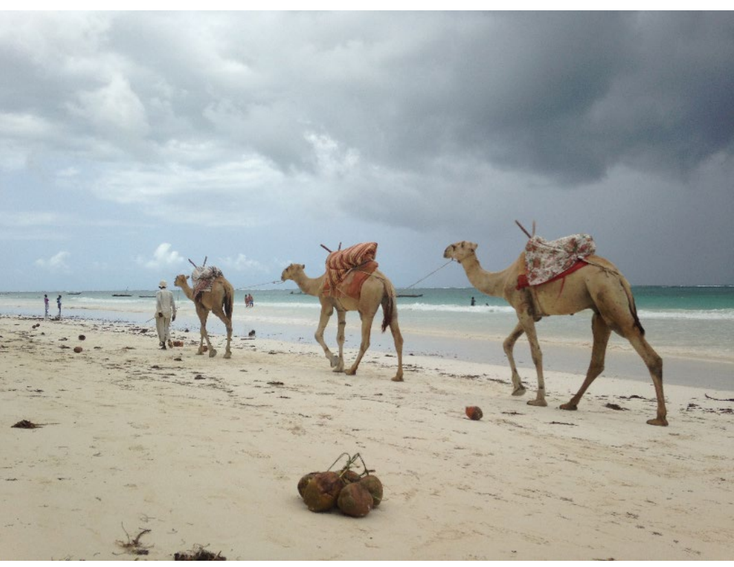
Masai local and camels at east coast in Kenya and a beautiful monkey walking along tree.