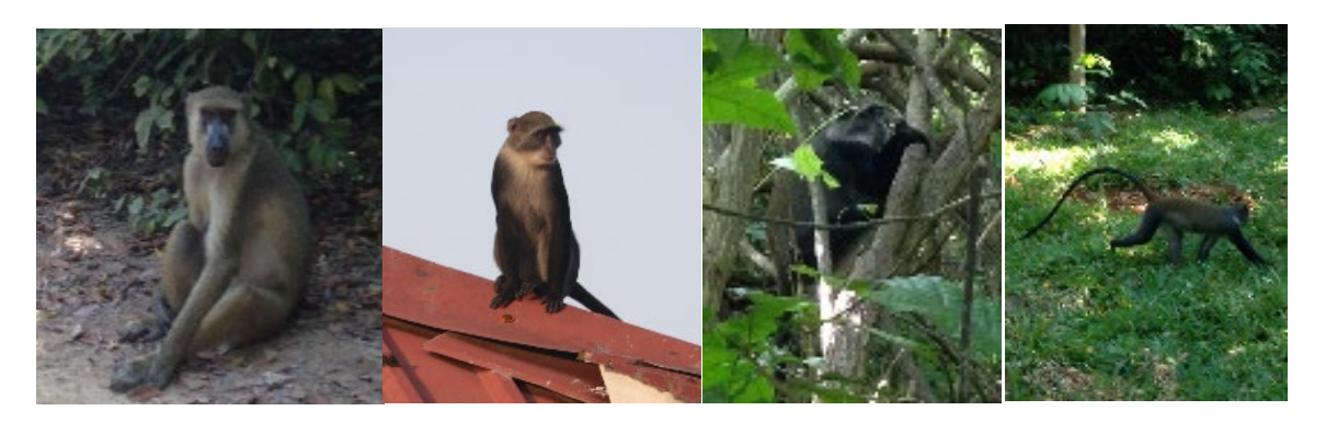
4 primate species that could be seen daily entering human habitat areas.