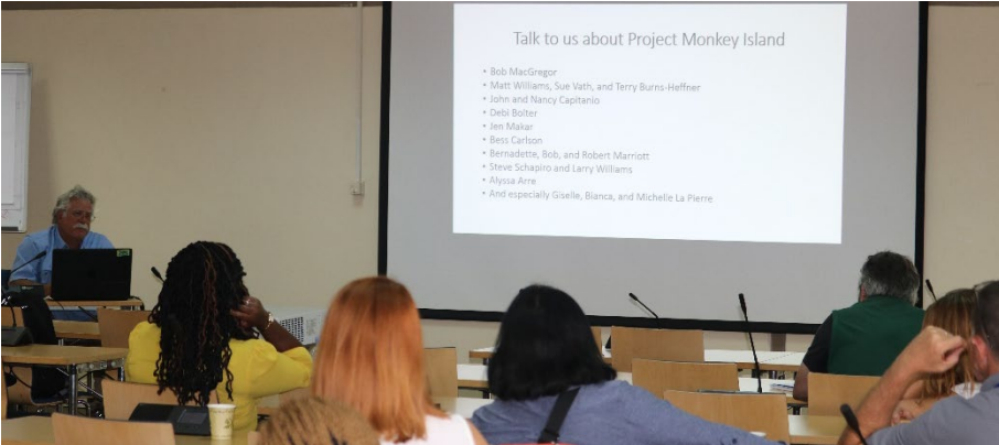
At my poster presentation with other nocturnal primate researchers and at the Behavioral Management presentations.