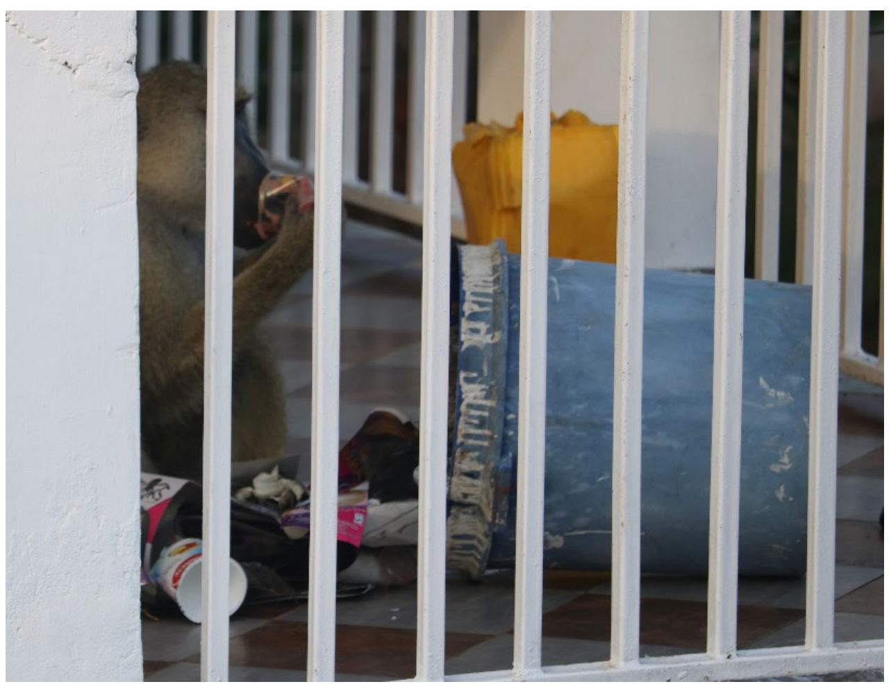
A baboon eating garbage from the hotel next to my room.