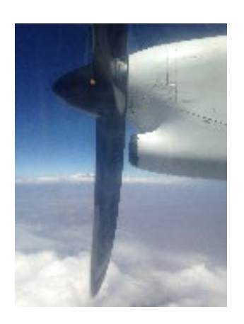
After my last day, from Nairobi to east Kenya, flying over Mt. Kilimanjaro to Ukunda for my visit to Colobus Conservation Center.