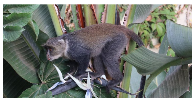
At the Latin America Primatology talks and a monkey eating flowers in the gardens of the UN Kenya.