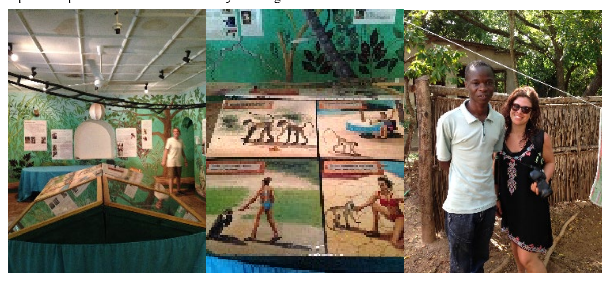
Visit to the Colobus Conservations Center and outreach tour by local volunteer student.