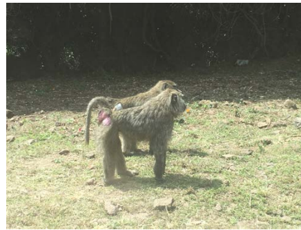
(Baboons on the street)