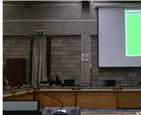
(My presentation. Photo by Liu Jie)