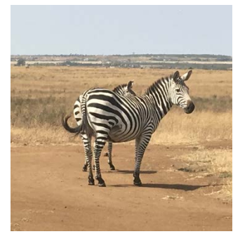
(Zebras in the National Park)