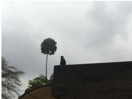
(A monkey inside UN)