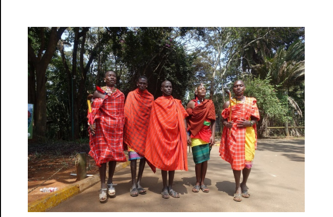
Fig 3. Masai dress