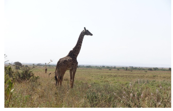
Fig 1. Wild giraffe in Nairobi National park