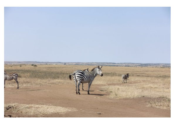
Fig 2. Wild zebra