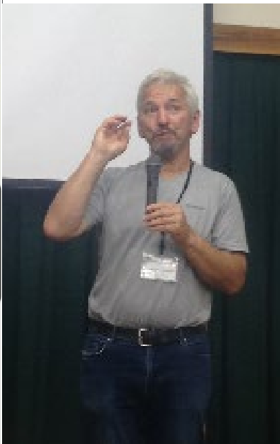
Poster for the Conserv'session event and specialist on filmmaking.