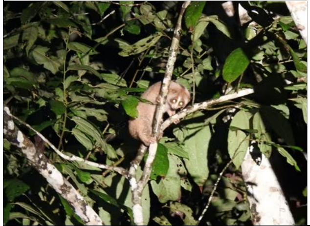
Pic.5 Loris: at night cruise