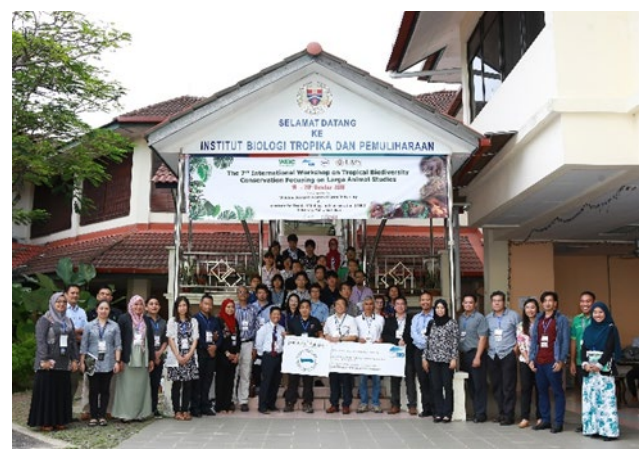
Pic.2 Group photo at Sabah University

In the second half of the schedule, I experienced various excursions at Sukau. We listened to lectures of NGO that confronted the problem of animal conservation and then experienced the actual tree re-planting activities. This tree replanting activity is supported by the local women's group. When I tried it myself, I felt it to be hard work. I realized once again the difficulty of regaining the lost nature.