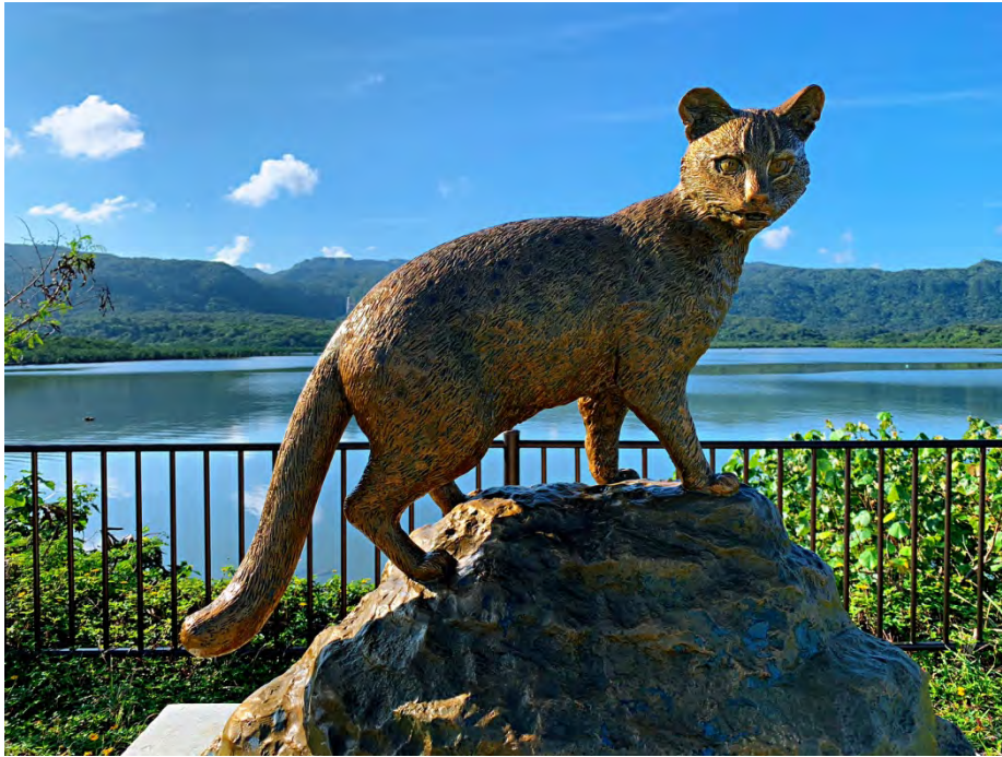
A statue of Iriomote Wildcat