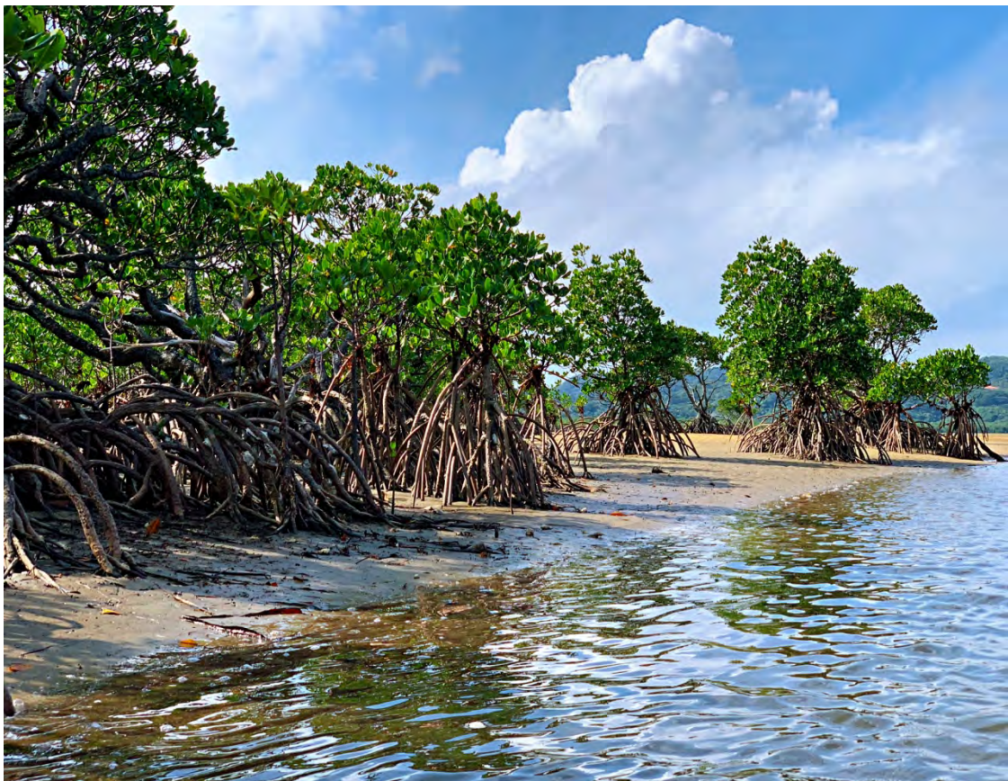
Tropical rainforests and mangroves swamps