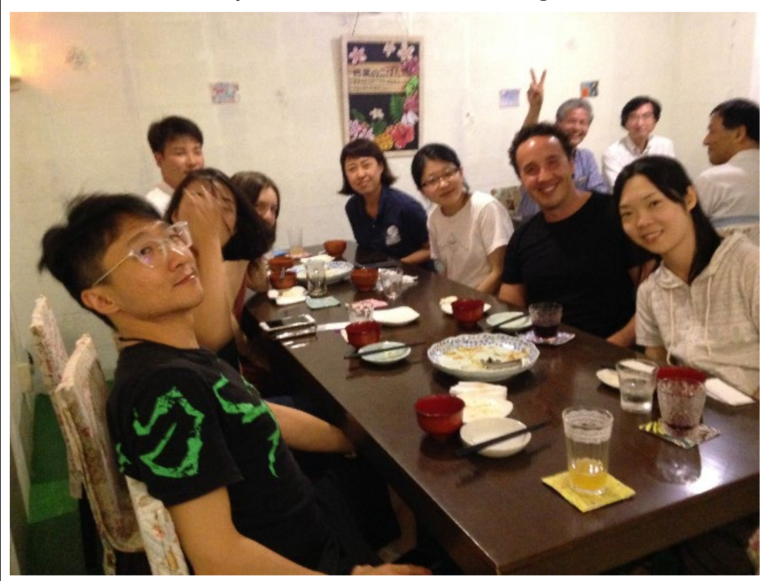
On our last night enjoying good local cuisine.

Submit \ to : \underline{report@wildlife\text{-science.org}}