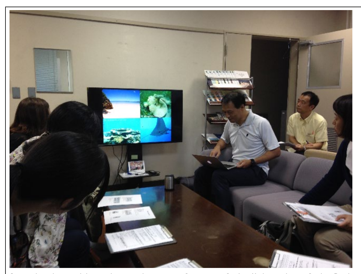
Introduction guidance by our hosts professors of the University of the Ryukyus.