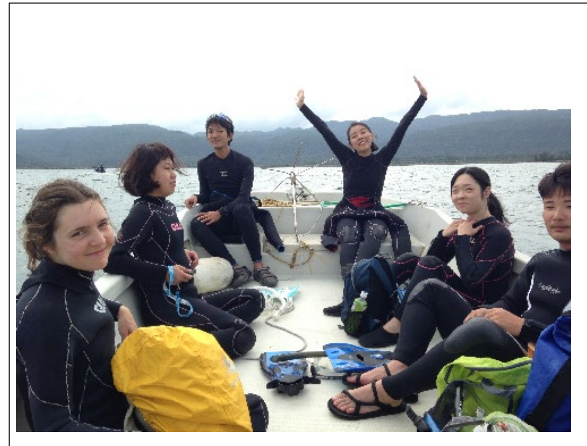
On our way to the reef for snorkeling.