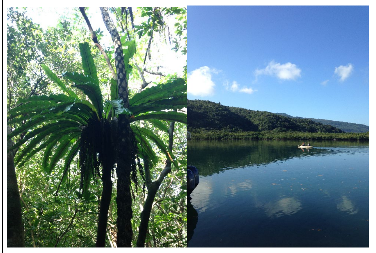
An endemic giant fern tree and canoeing by the river.

Submit\ to: \underline{report@wildlife\text{-science.org}}