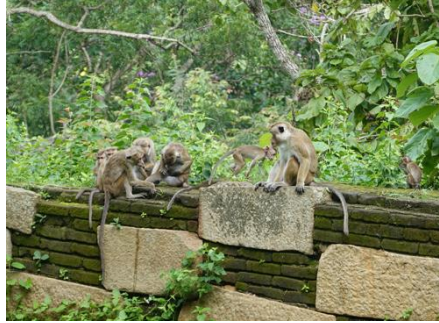
(macaques at Mihintale)