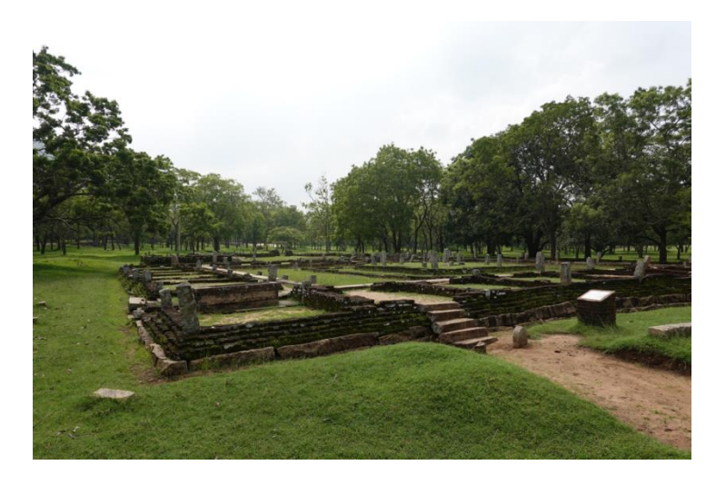
(the oldest hospital perhaps in the world, at Mihintale)

I was also very impressed about the archeological sites in Sri Lanka. Not only were there the oldest modern human civilizations, but also many pre-historical remains. It has been a wonderland for humans to live and grow.