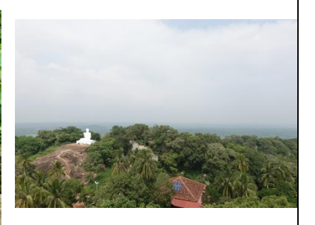
(view from Mihintale)