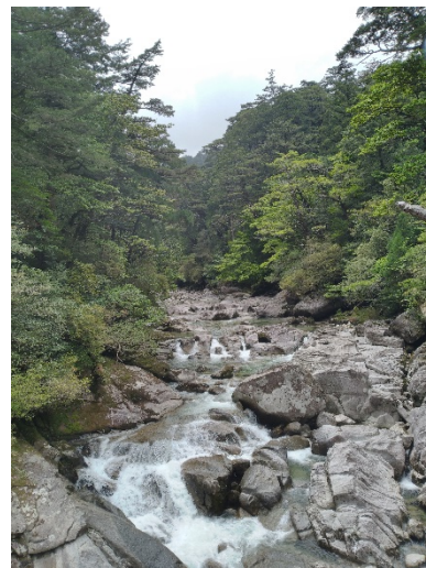
Fig 4. Stream in Yakusugi Land