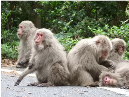
Fig 1. Yakushima's Monkey

Through this experience, my field study experience was enriched especially how we observe animal in their natural habitat and also how to do non invasive sampling method (collecting faecal sampel) and i can meet and interact with other people from many different country, making friend with them, do work together, do conversation about many things, like the culture in our country.