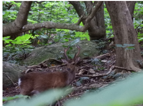
Fig 2. Yakushima's Deer