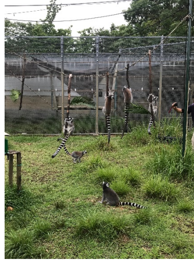
Figure 4 Environmental enrichment for Ring-tailed lemurs