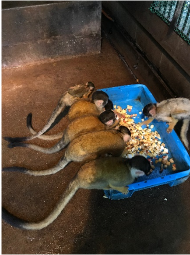
Figure 3 I experienced feeding for squirrel monkeys.