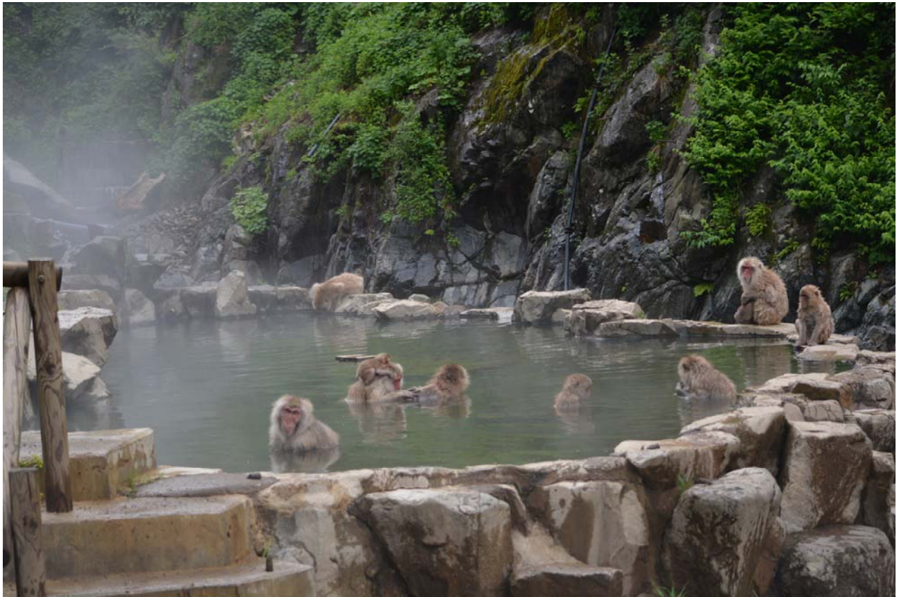
Figure 1. Japanese monkeys bathing at the hot spring