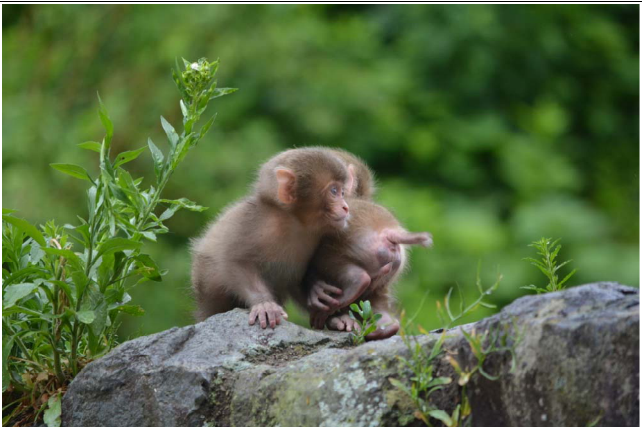
Figure 5. Two babies (approximately 1 month-old) playing