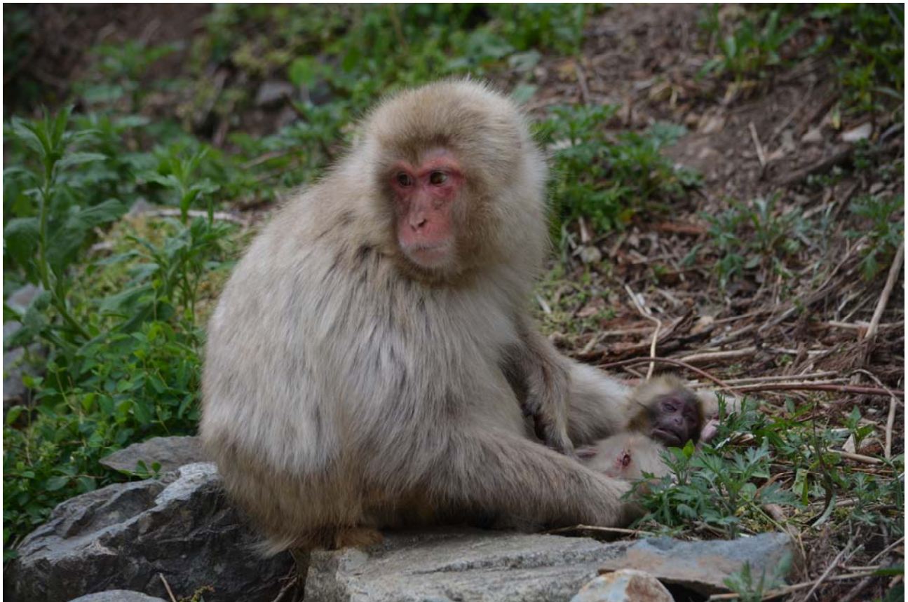
Figure 6. Adult female Japanese monkey with her dead baby