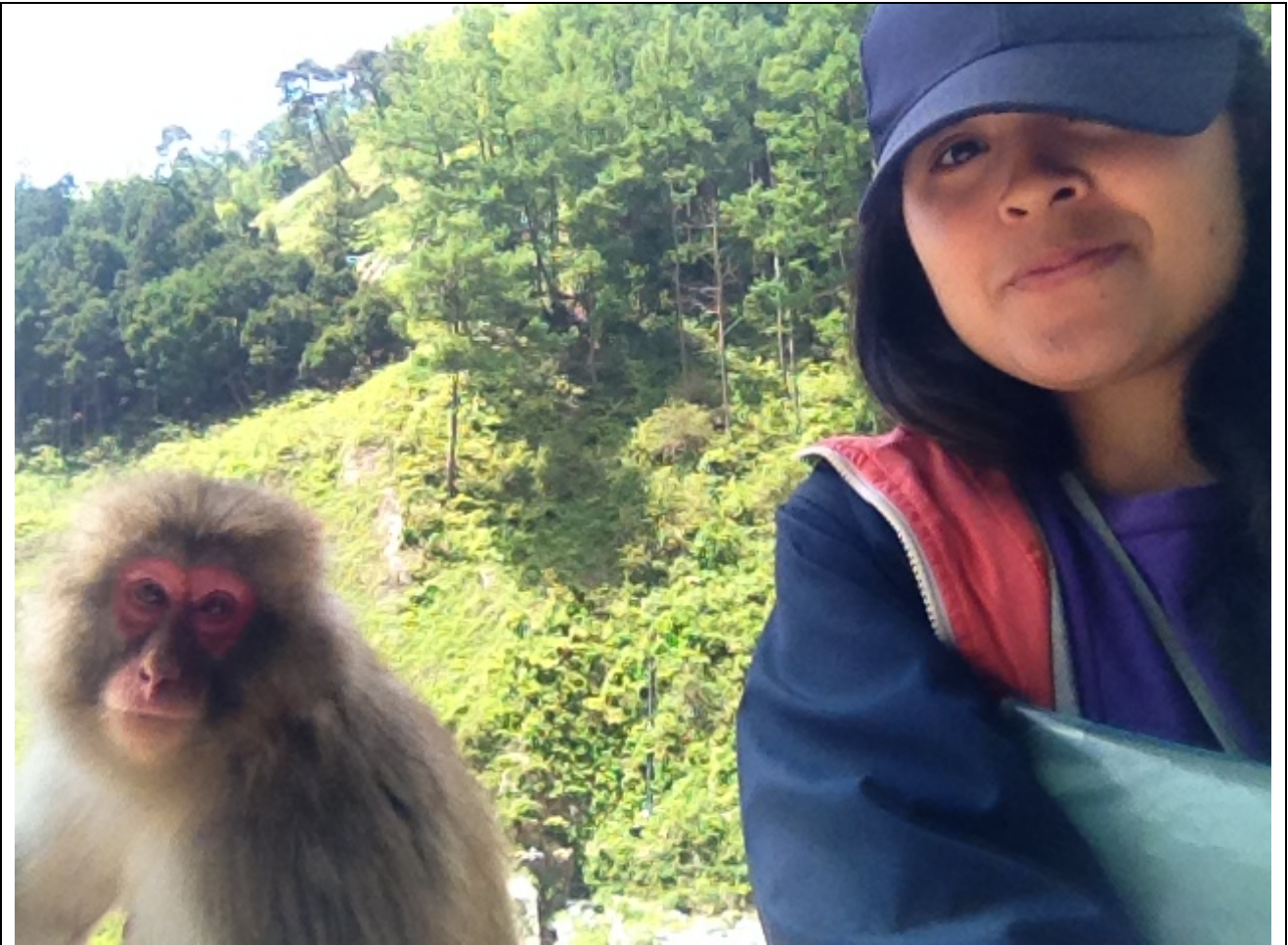
Figure 4. Female Japanese monkey approached me while I was collecting data. Tempting, but I did not touch her. Could not resist taking a picture though.