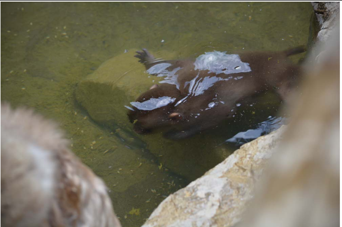
Figure 2. Japanese monkey diving to get food at the hot spring