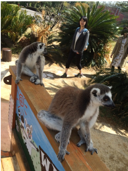
Japan Monkey Centre