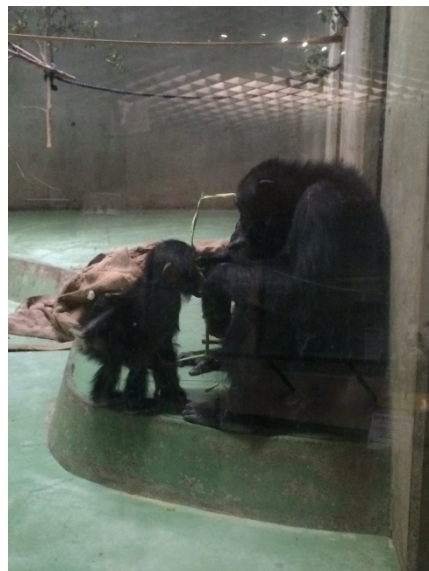
Japan Monkey Centre