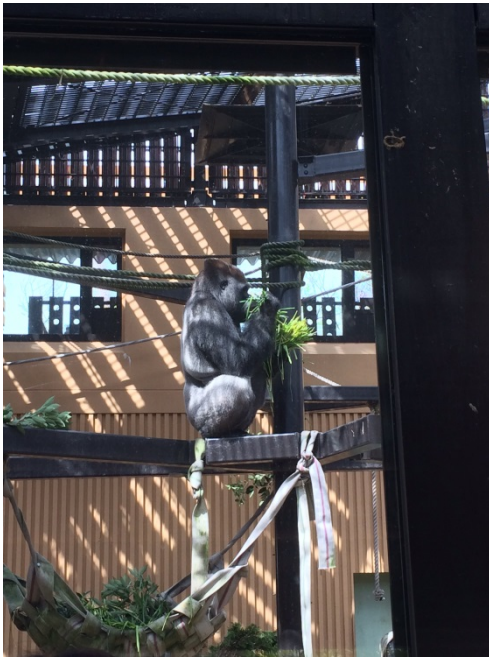
Kyoto city zoo