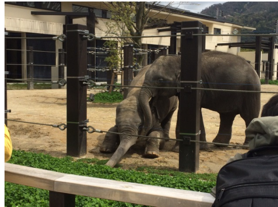
Kyoto city zoo