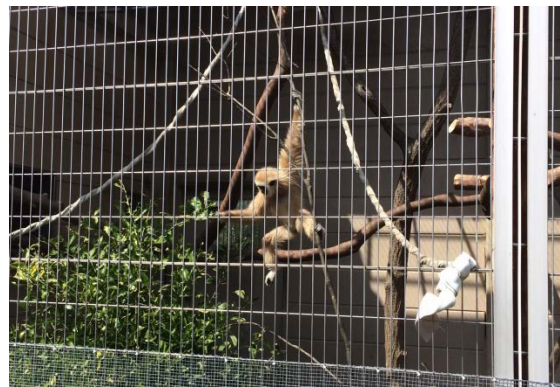
Japan Monkey Centre