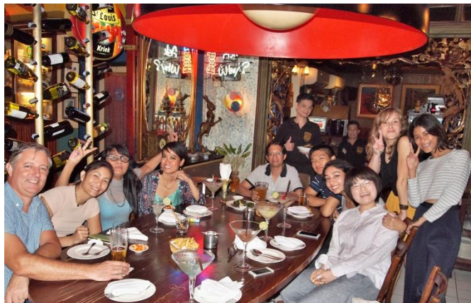
The staffs kindly held a farewell party for me.

These precious experiences made a great difference in my perspective of the world. Working for conservation works step by step, with many stake holders’ understanding. Working inside an International Organization is working with the each person, regardless of the person’s nationality.