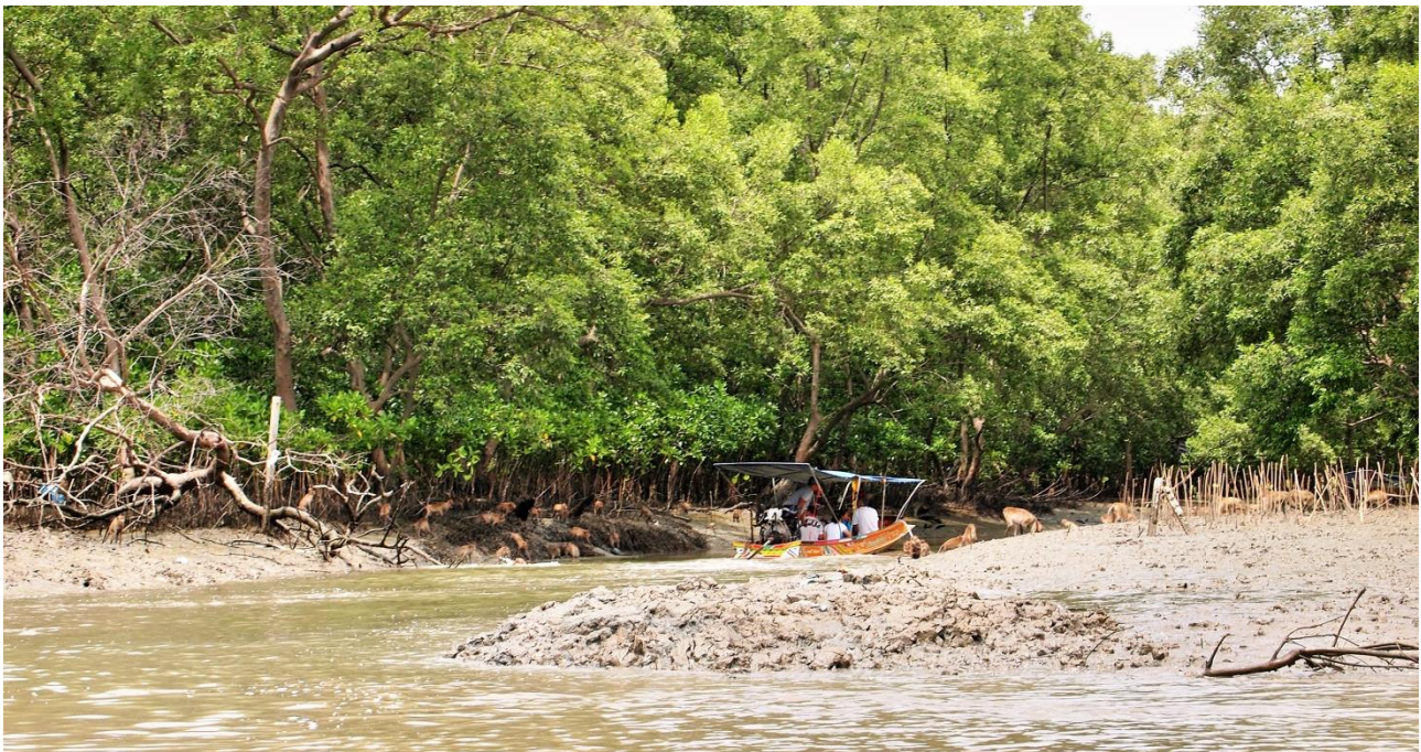
The monkeys approach to the tourist boat immediately when they hear its sound, to get something to eat.

The work at Membership was to make a membership list of IUCN Asia for the coming World Conservation Congress 2016 at Hawaii. This was a chance to know the numbers of the organization in Asia, country by country.