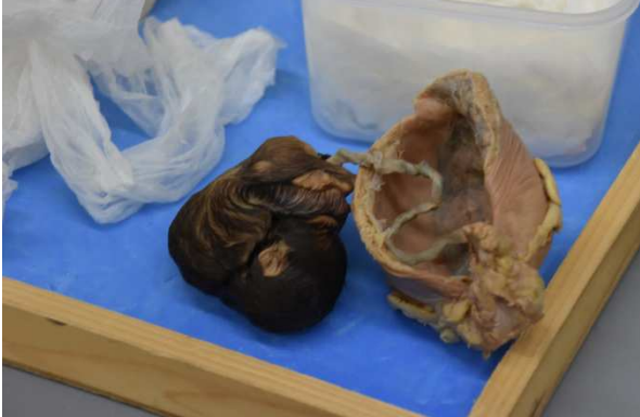
Tour by Watanuki curator