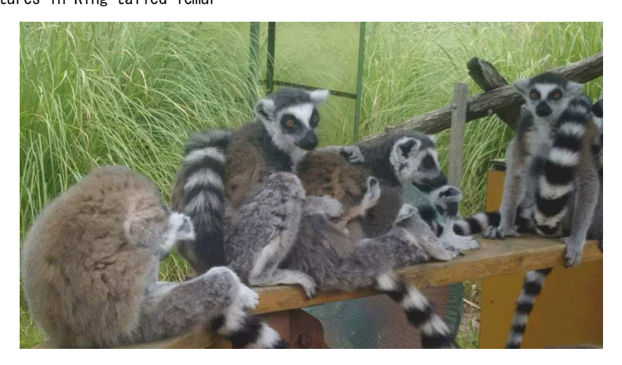
Care taking training in Ring-tailed lemur