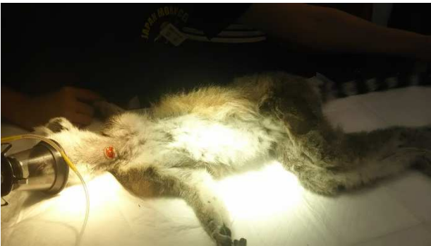
Ring-tailed lemur under anesthesia